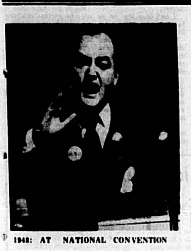
HUBERT HORATIO HUMPHREY May 27, 1911 to Jan. 13, 1978