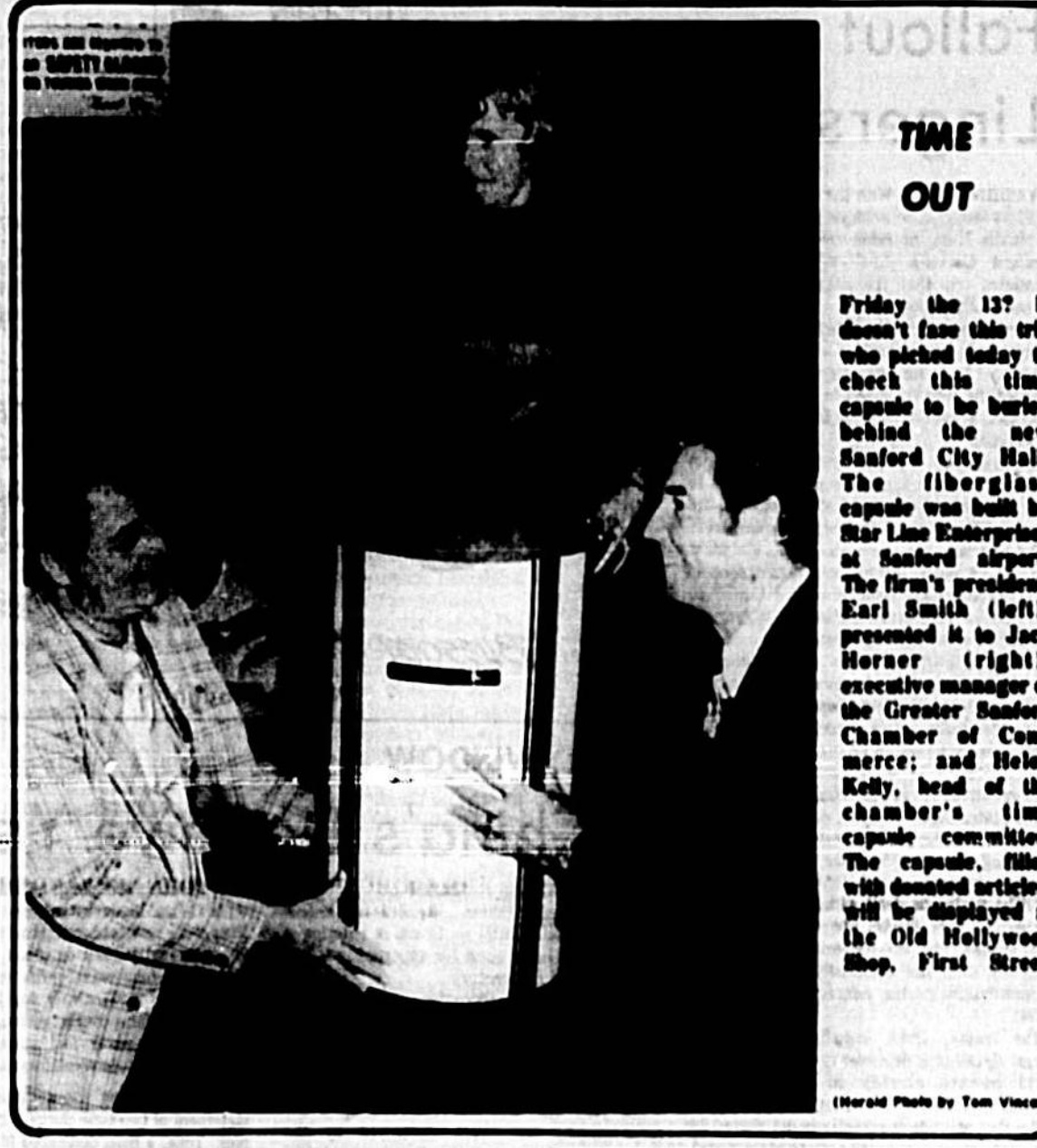
Friday the 13th! Friday the 13th! Friday the 13th!