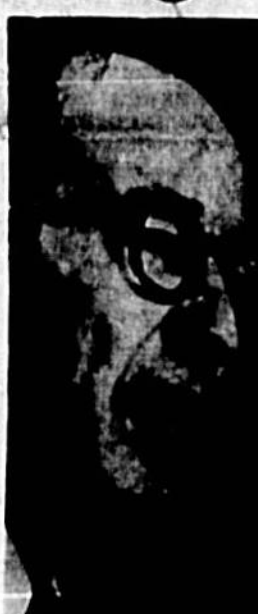
GRIFFIN BELL. ... It was his idea