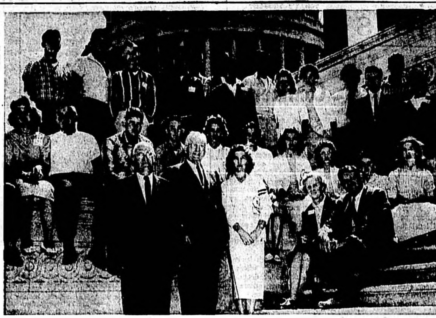
SENATOR SPESSARD HOLLAND (second from left, first row) and Congressman Syd Herlong (on Holland's right) extend official welcome to the Nation's Capital to the senior class from Plerson High School, which toured Washington, D. C. recently. Despite the press of legislative

affairs, Senator Holland has met and given personal greeting to nearly two thousand young Floridians representing high school groups and school safety patrols during the past two weeks.