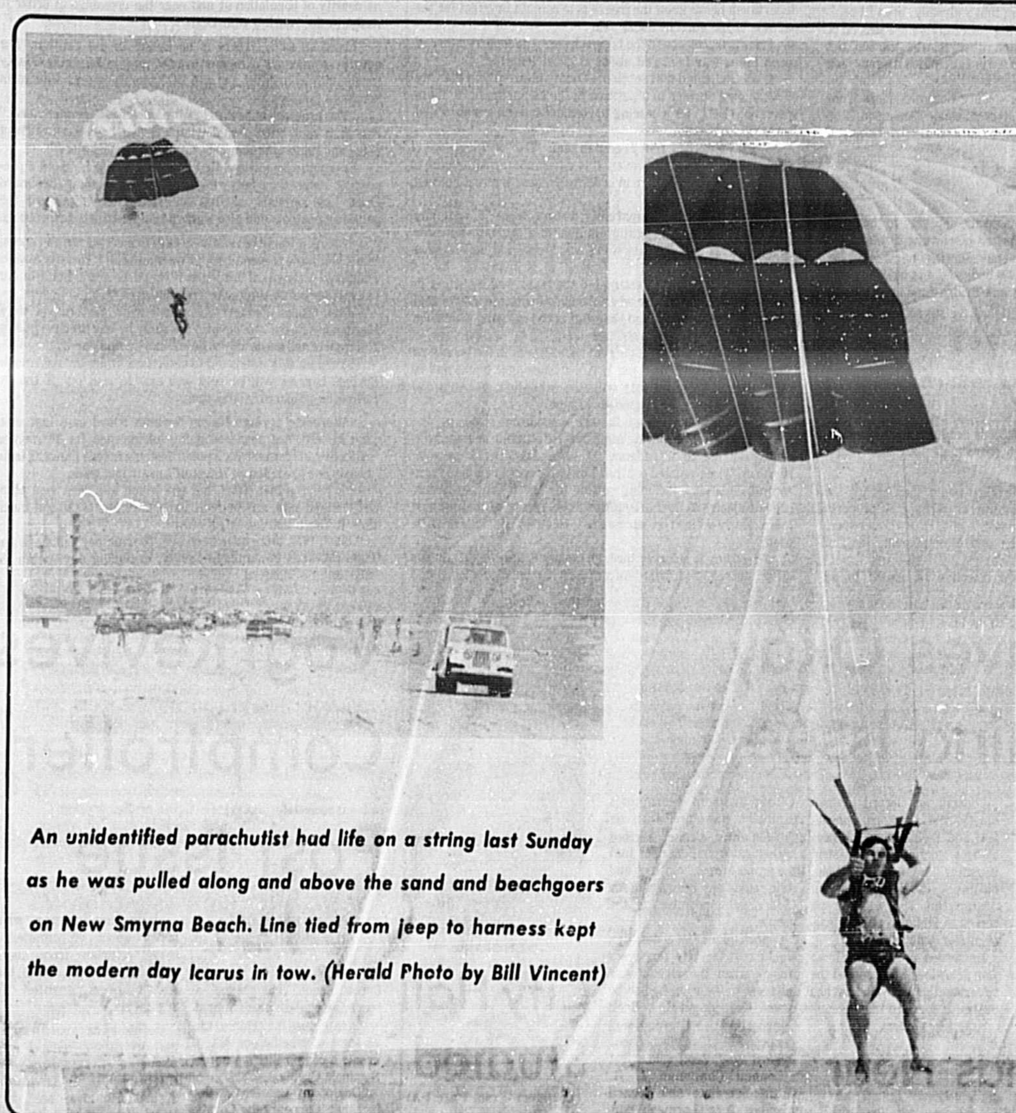
An unidentified parachutist had life on a string last Sunday as he was pulled along and above the sand and beachgoers on New Smyrna Beach. Line tied from jeep to harness kept the modern day Icarus in tow.

67 Year, No. 215 - Tuesday, April 29, 1975 Sanford, Florida 32771 - Price 10 Cents