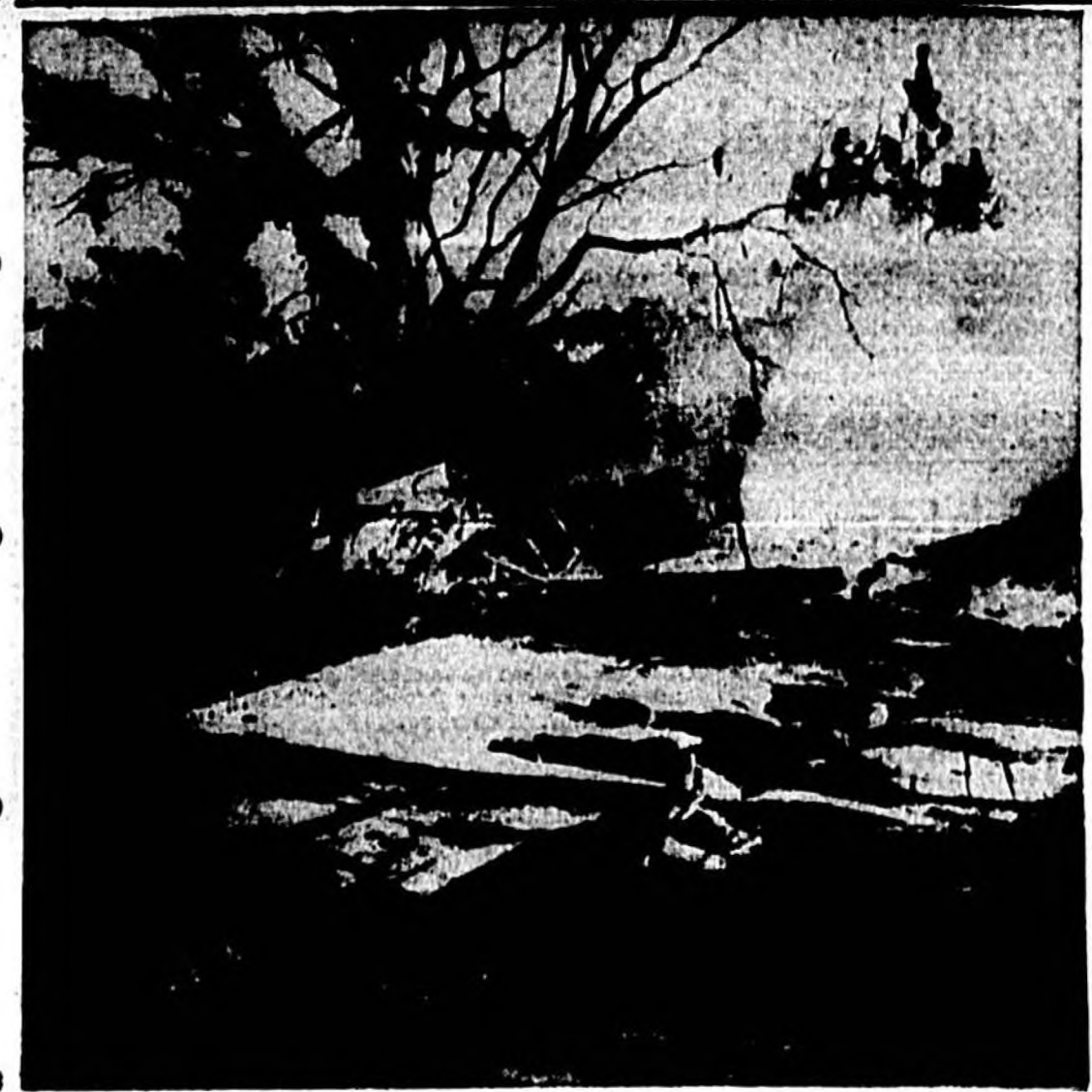
ALL THATS LEFT of a wing of a giant B-47 Stratojet which crashed this morning about one mile north of Chuluota.