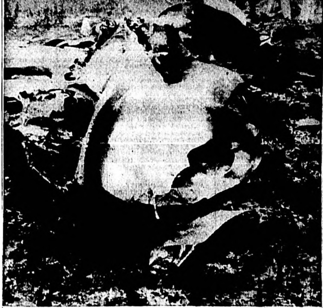
ONE SECTION OF the B-47 Stratojet which ripped apart as it crashed into a wooded area about 8:30 this mo, ling near Chuluota, ( Staff Photo)