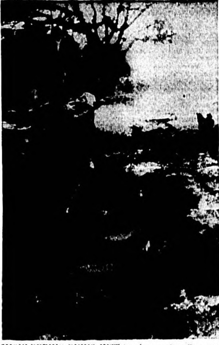
SMOULDERING RUINS JUST two hours after five crew members parachuted to safety in an Air Force B-47 Stra-