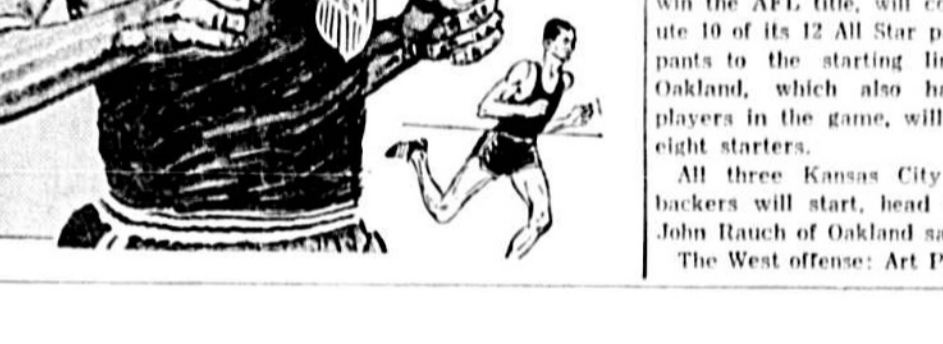
JIM RYAN WHO BROKE THE WORLD OUTDOOR WILE RECORD WITH A 3.83 60-YARD SPRINT, SAID HE IS ONE OF THE WHITEST TOP ATTRACTIONS AS HE SKOOTS AT THE INDOOR MARK.