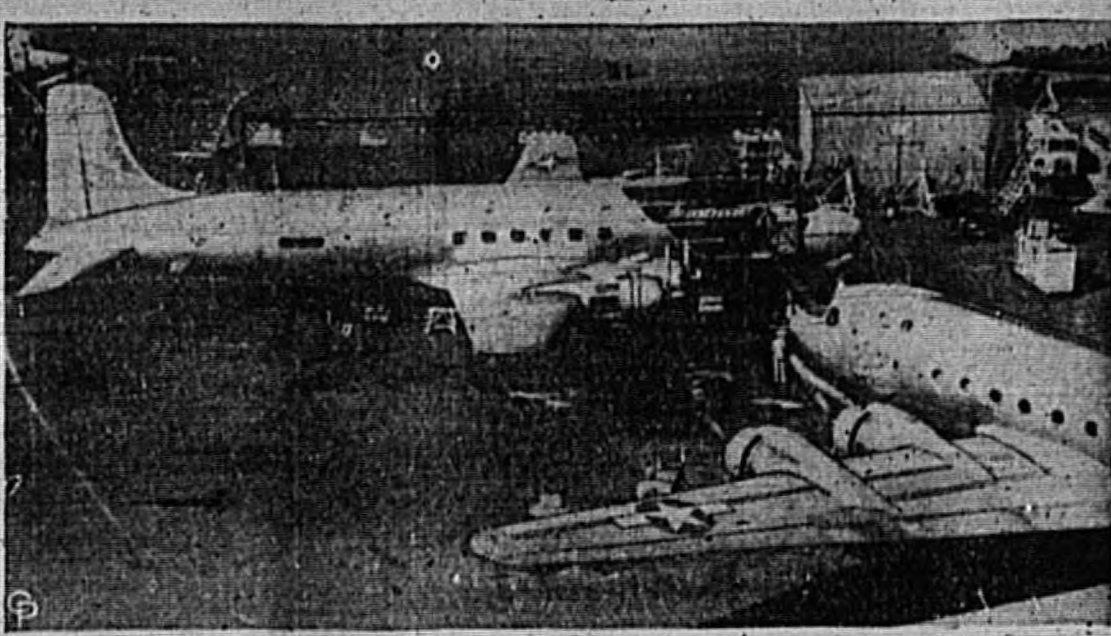
PICTURED AT THE DOUGLAS AIRCRAFT PLANT, Santa Monica, Cal., President Truman's newest plane, the Independence, named for his home town in Missouri, is given a final check preparatory to flight tests as it rests beside the Chief Executive's old plane, the Sacred Cow. The new ship, which is receiving some of the older plane's equipment, will be delivered to the President on July 4th.