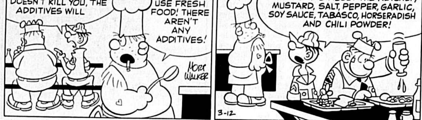
SARGE, IF OVEREATING DOESN'T KILL YOU, THE ADDITIVES WILL... HEY! I ONLY USE FRESH FOOD! THERE AREN'T ANY ADDITIVES!... I'M TALKING ABOUT THE KETCHUP, MUSTARD, SALT PEPPER, GARLIC, SOY SAUCE, TABASCO, HORSE RADISH AND CHILI POWDER!