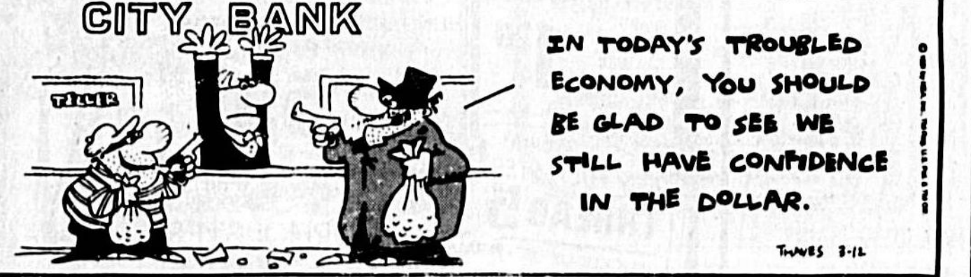
CITY BANK... IN TODAY'S TROUBLED ECONOMY, YOU SHOULD BE GLAD TO SEE WE STILL HAVE CONFIDENCE IN THE DOLLAR.