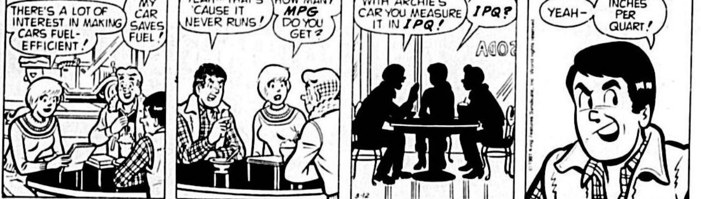
THERE'S A LOT OF INTEREST IN MAKING CARS FUEL EFFICIENT... MY CAR SAVES FUEL... YEAH—THAT'S NEVER RUNS!... HOW MANY MPS DO YOU GET?... WITH ARCHIE'S CAR YOU MEASURE IT IN IPQP?... YEAH—INCHES PER QUART!