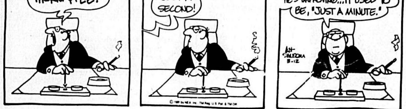
THORAPPLE!... JUST A SECOND!... HE'S WARNING... IT USED TO BE, 'JUST A MINUTE'!