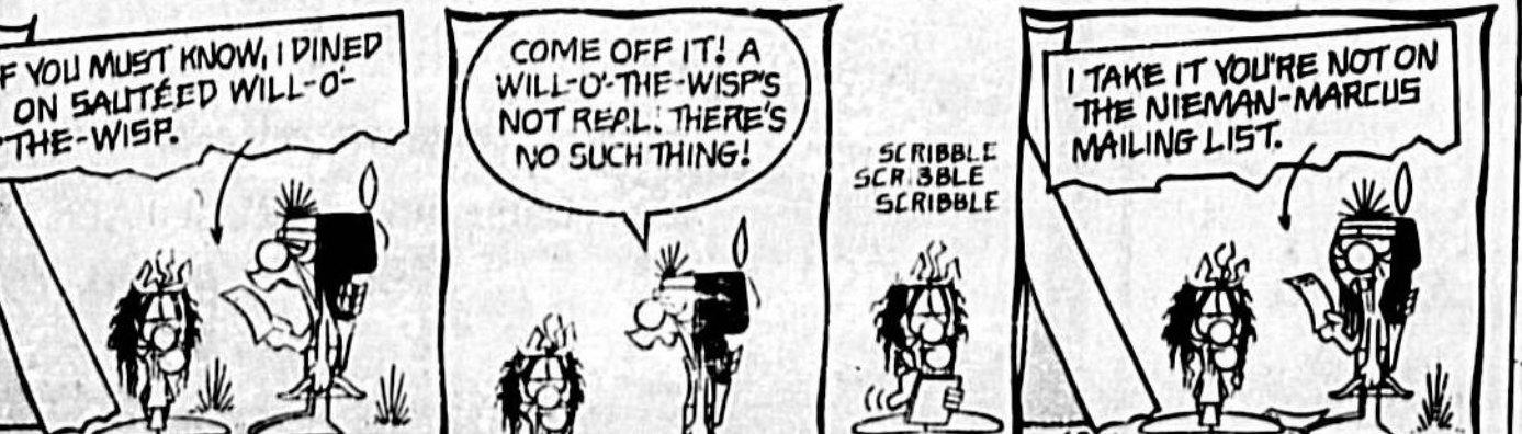
IF YOU MUST KNOW, I PINED ON SALTIEED WILL-O'-THE-WISP... COME OFF IT! A WILL-O'-THE-WISPS NOT REAL! THERE'S NO SUCH THING!... I TAKE IT YOU'RE NOT ON THE NIEMAN-MARCUS MAILING LIST!