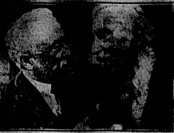
President Zamora (left) of Spain, talks it over with Colonel Francisco Marica, president of Catalonia. The topic? The newly established Spanish constitution.