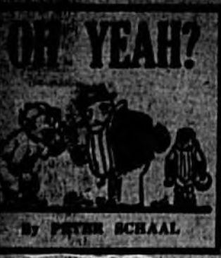
BY PETER SCHAAL