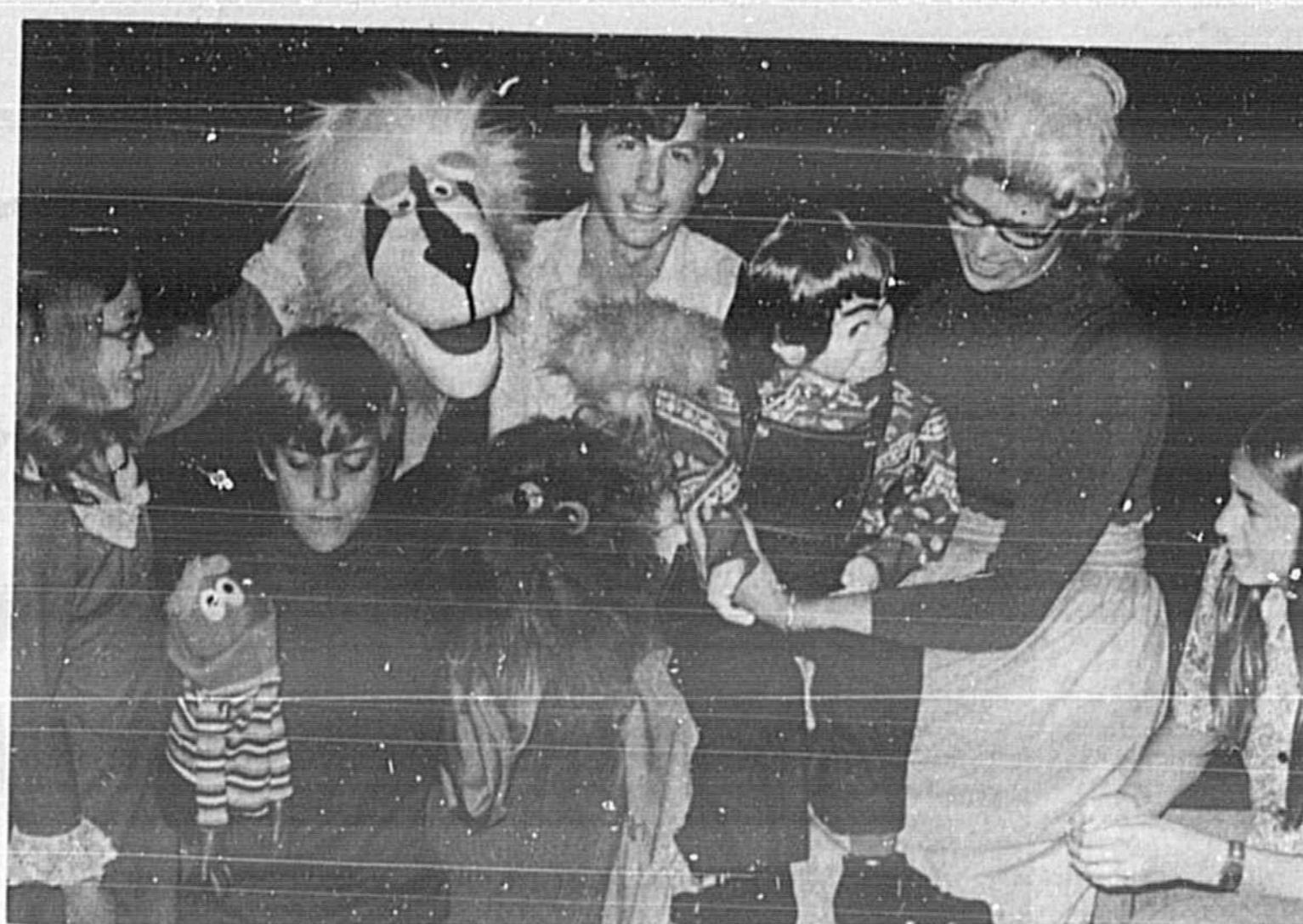
PUPPET SHOW SPONSORED A puppet show featuring the Warren Bell Puppets' version of "Daniel and the Lion's Den" was sponsored Saturday by the Sanford Alliance Church Junior Girls Club.

Each night there will be a special emphasis: Sunday - "Pack the house" night; Monday - Puppet night; Tuesday - Central Baptist puppets will perform; Wednesday - "Sunday School night"; Thursday - Youth night; Friday - Family night.