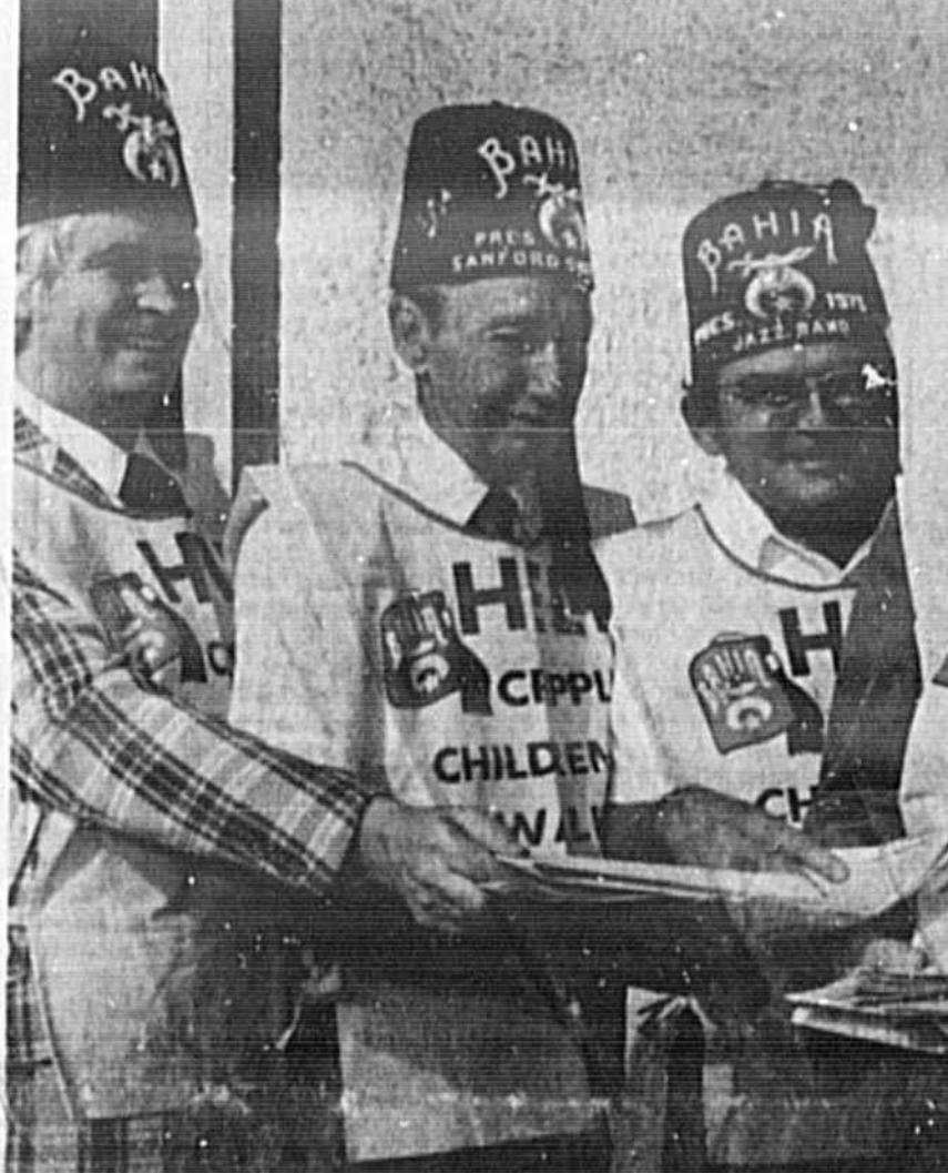
Shrine Temp and the Sanford Shrine Club have set aside March 24 for their annual "paper sale." Baha'is collected will be used to support Shrine Crippled and Burns Hospitals throughout the nation.