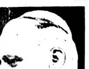
ARCHBISHOP JOSEPH EGAN