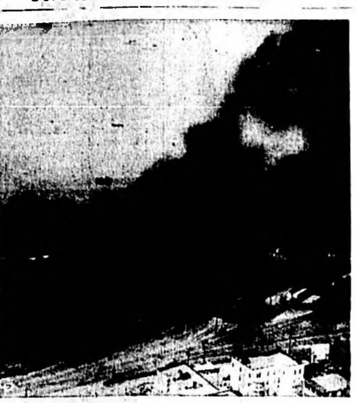
A BLACK PALM OF SMOKE from a five-alarm fire blots out the blazing coal-loading pier on Staten Island, N. Y., which burned to the water's level. Coal dust explosions sent the flames racing in all directions. Seven firemen were hurt. Damage was set at $500,000.