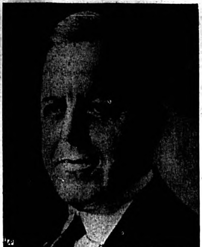
Former Gov. Joseph B. Ely of Massachusetts, has issued a statement in which he proposes to follow the lead of Alfred E. Smith in "taking a walk" during the presidential campaign.

Some of the measures advocated by the President and supported by the administration in the "interest of national recovery" were declared unconstitutional, but that does not change the fact that the President, fearlessly and in face of considerable opposition, has developed and moved forward with a definite program for national recovery.