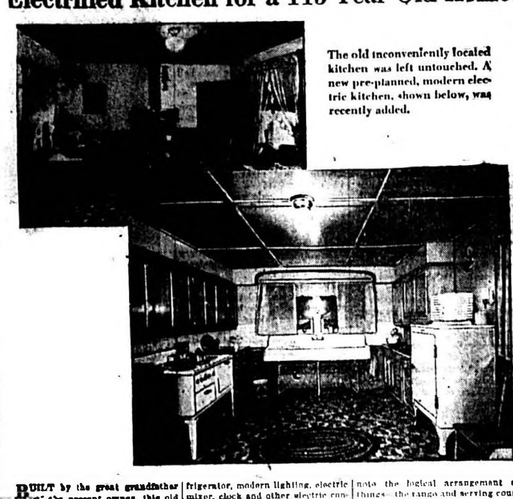
The old inconveniently located kitchen was left untouched. A new pre-planned, modern electric kitchen, shown below, was recently added.