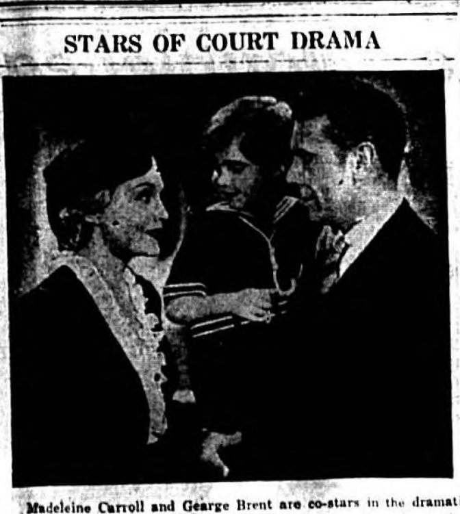
Stars of Court Drama... Madeline Carroll and George Brent are co-stars in the dramatic Walter Wanger picture...