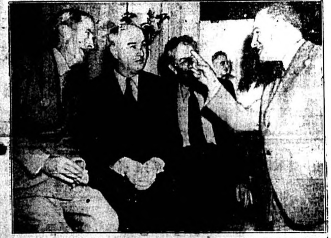
In Philadelphia to plan for the Democratic National convention, James A. Farley, the party's national chairman, became the target for a barrage of political questions fired by William Allen White, the famous Kansas editor and staunch supporter of Gov. Alf Landon. The interrogations of White (second from right) seem to have been quite successful.