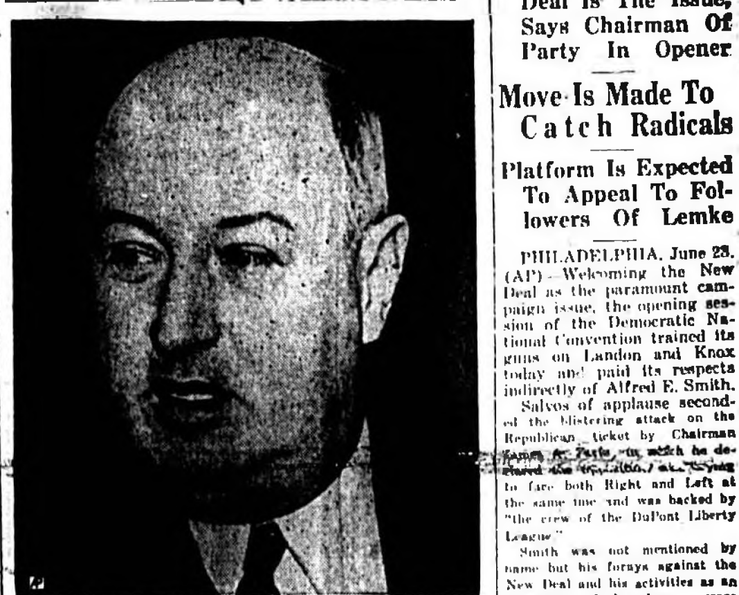
James A. Farley, postmaster general, and chairman of the Democratic National Committee, is holding the biggest convention of his life in Philadelphia, where he expects to nominate President Roosevelt almost by acclamation and start his ball rolling for another landslide in November.

Continuation Of New Deal Is The Issue, Says Chairman Of Party In Opener