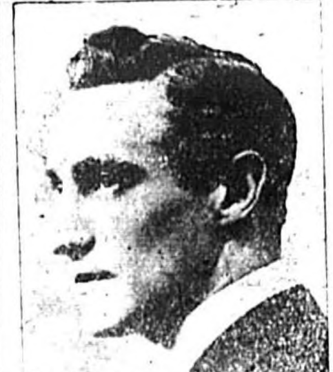
LOU TELLEGEN IN "THE UNKNOWN" AT THE STAR THEATRE TONIGHT DECEMBER 20th

The story of "The Unknown" has to do with members of the famous foreign legion, that great military sanctuary of Algeria. A young Eng-