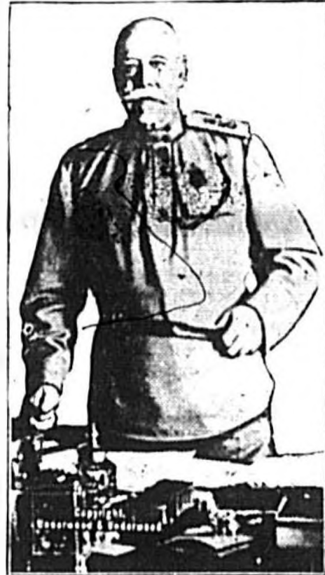
The lack of ammunition, which the Russians say was the cause of their repeated defeats, has been put up to