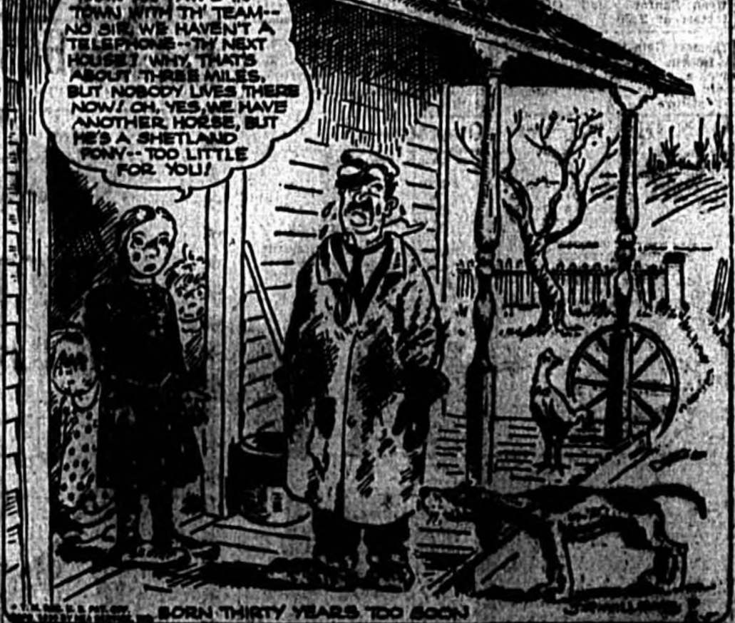
BORN THIRTY YEARS TOO SOON