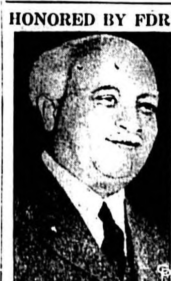
Haiti's president-elect Elie Escobé is pictured as he arrived at the White House, where he and his staff were guests of honor at a luncheon given by President Roosevelt.

The battle still is raging after two days, but those Axis forces remaining inside the outer perimeter of the Libyan fortress have been stopped there, the British said.