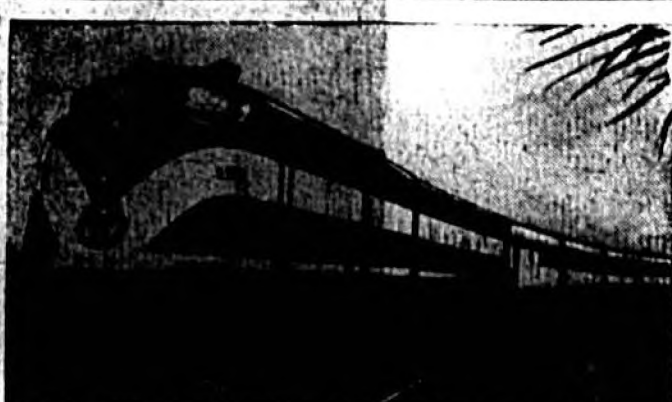
Here is a view of the Tamiami Champion, sleek new Atlantic Coast Line train, which was welcomed in Sanford and other Central Florida cities today on a preliminary run before it begins regular service to northern points tomorrow.