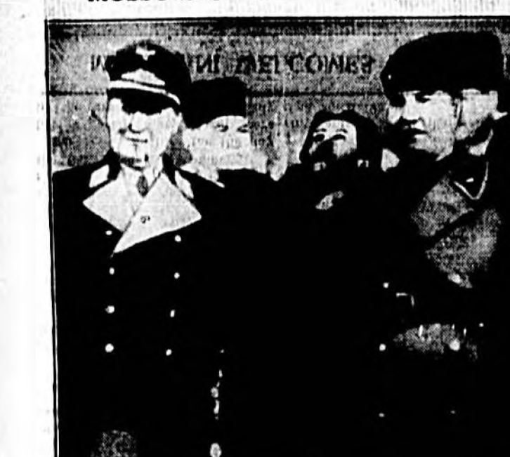
When Herman Wilhelm Goerring, the German Nazi air minister, arrived in Rome for an official visit, he was welcomed heartily by Premier Mussolini and a great Fascist demonstration of anti-German friendship.