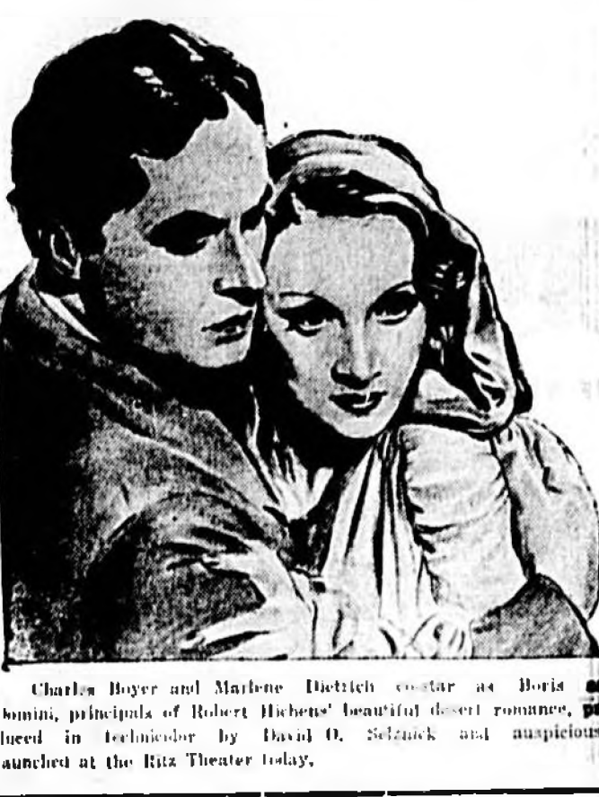
Charles Boyer and Marlene Dietrich costar in "Garden of Allah" which opens at the Ritz Theater today.