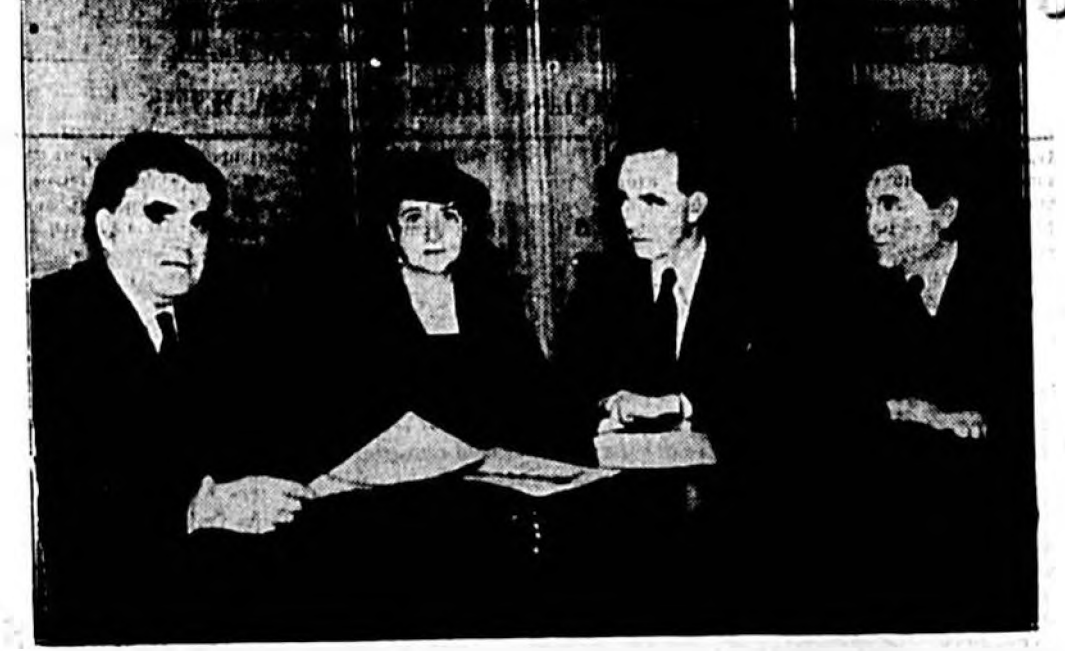
Returning to New York from Spain where they fought for the government, a group of Spanish fliers were being questioned by the Federal grand jury.