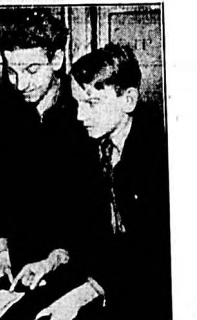
Because they reported him on the telephone as being in the vicinity of the kidnaping, a man who was identified as being the man who kidnaped and killed little girl, was charged with assault and battery.