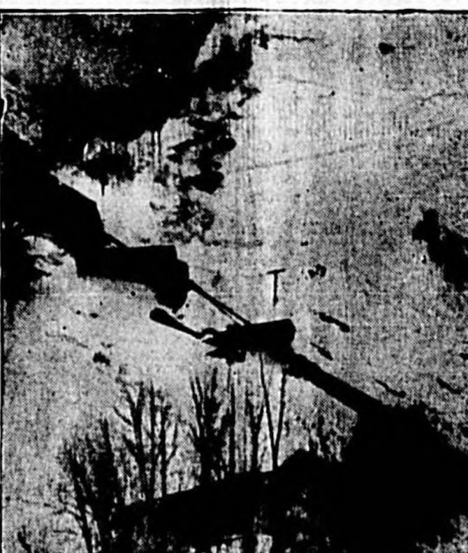
Undermined by the flooded Cumberland river, a section of railroad track collapsed near Clarksville, Tenn., and derailed 15 cars of a Louisville and Nashville freight train bound from Bowling Green, Ky., to Memphis. Some of the cars are shown partially submerged. No one was injured.