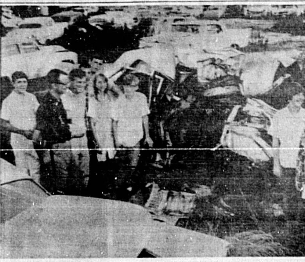
ALLIANCE Youth Fellowship of Sanford Alliance Church toured local wreacking yard as part of a special program on auto safety Tuesday evening.