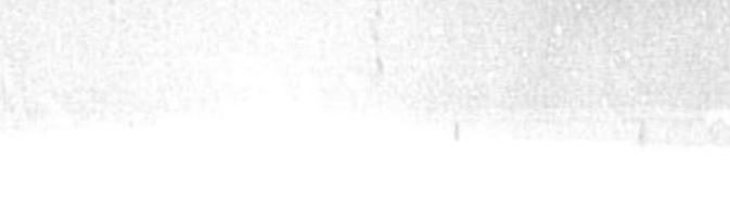
'GET THE HELL OUT OF CZECHOSLOVAKIA' was the gist of a telegram dispatched this morning by Sanford-Seminole Junior Chamber of Commerce to the Kremlin in Moscow.