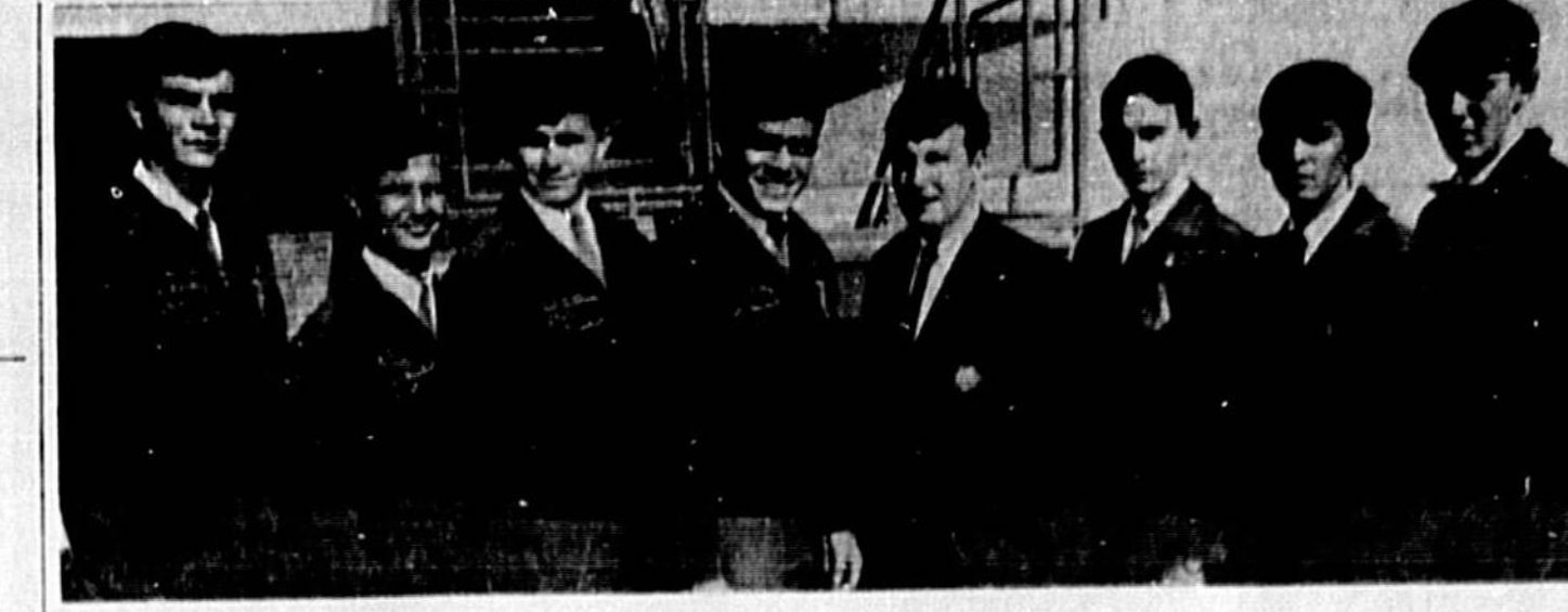
FLORIDA STATE officers of the Future Farmers of America, with a delegate from Scotland, convened yesterday and today at Holiday Isle, and toured the Sanford area.

Information: Concerning this page Dial 322-2611 Or 425-5938