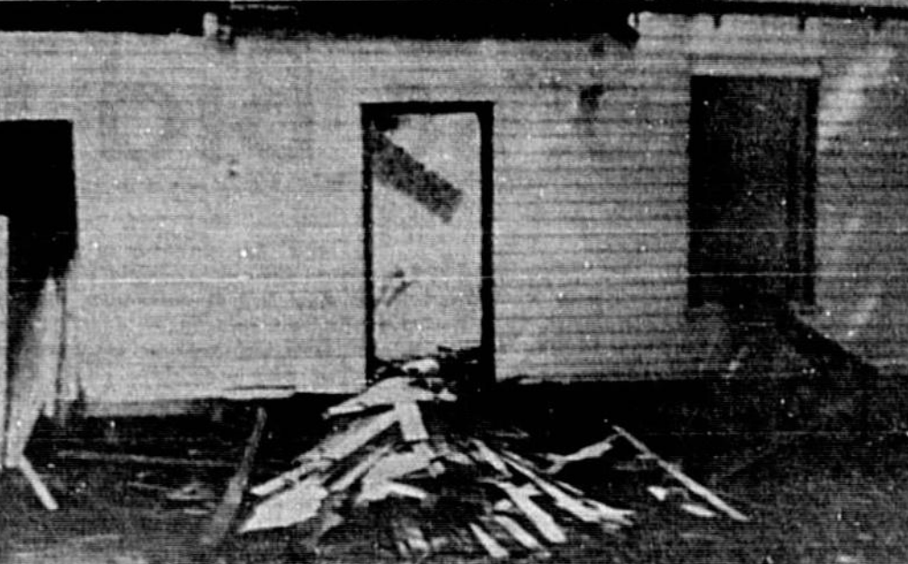
THIS HOUSE, dating back to 1887, was once used as the First Baptist Church in Oviedo. It is now being razed to make room for a future church parking lot.