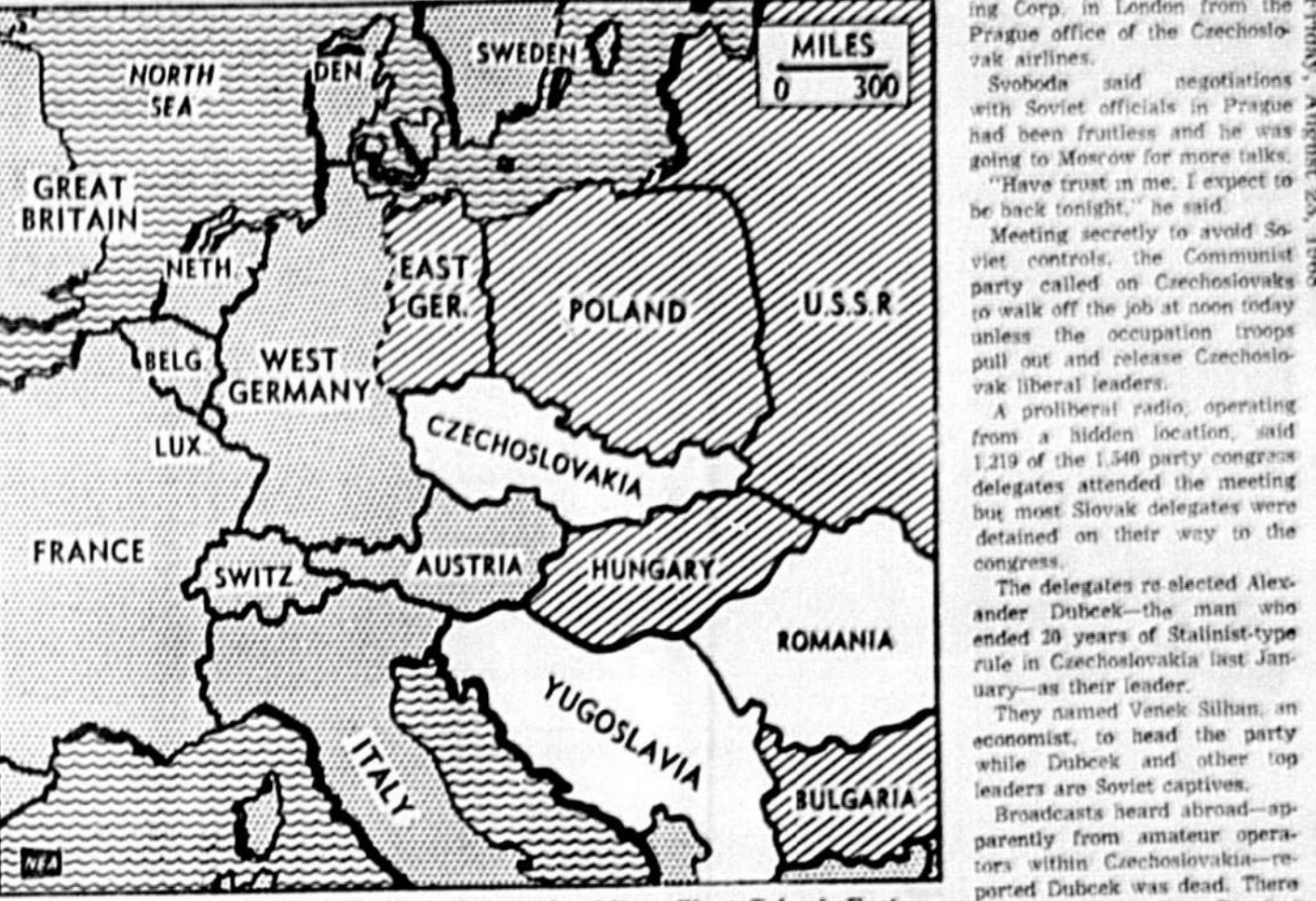
TROOPS of the Soviet Union and its four hard-line allies—Poland, East Germany, Hungary and Bulgaria—comprise the invasion force. Missing lines are Yugoslavia and Romania, which have supported the liberal government in Prague.