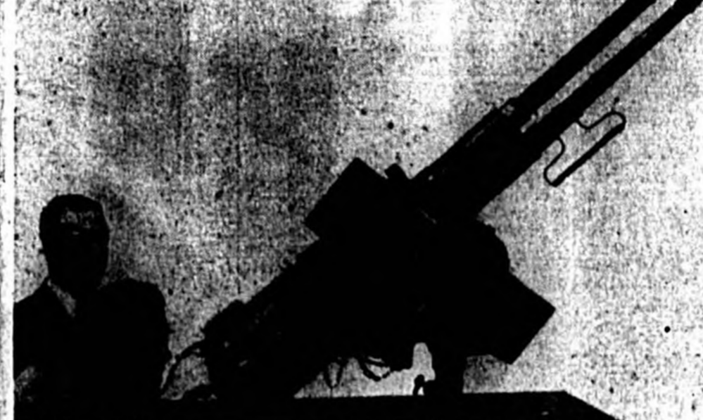
Vice President Henry A. Wallace sights a 37 mm. anti-tank gun mounted on an armoured car during a congressional inspection of Fort Belvoir, Va. From the angle of the gun, the Vice President seems more concerned with possibility of trouble from the air. Looking on is Undersecretary of War Robert Patterson.