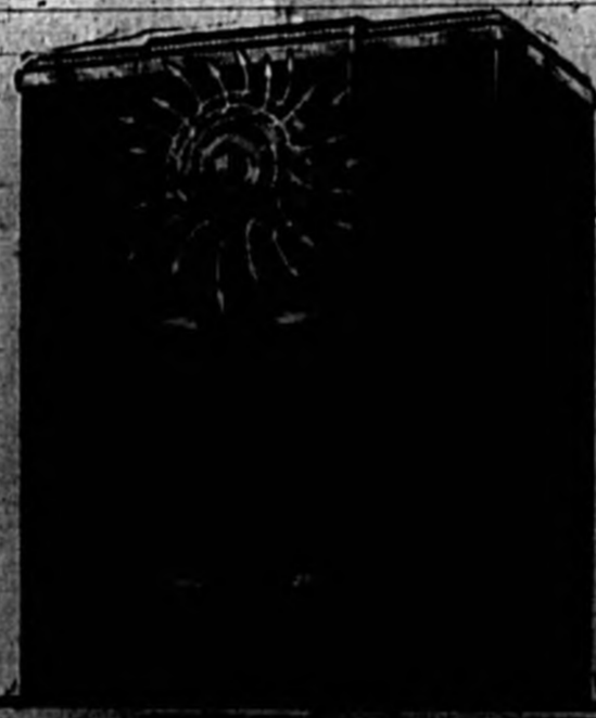
FLORENCE DRIVEN-AIRE OIL HEATER