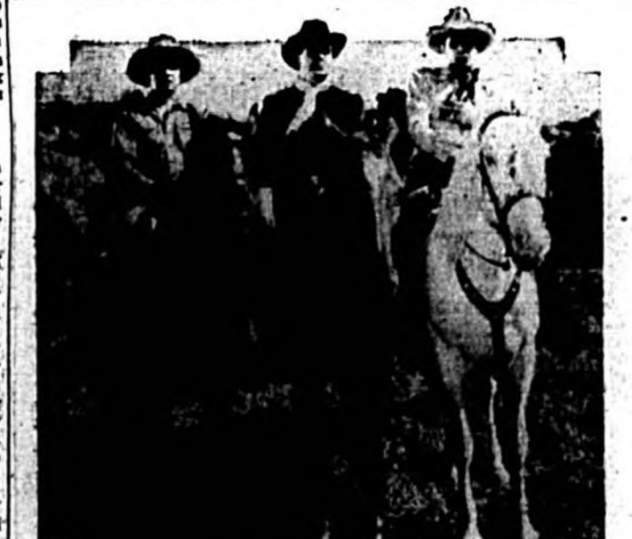
ACTION A-PLenty is promised Western fans in the showing of "Saddlemates," Republic's thrilling story of savage Redskins on the warpath, to be seen next Friday and Saturday at the Ritz. The "3 Mesquiteras," Robert Livingston, Bob Steele and Rufe Davis starred.