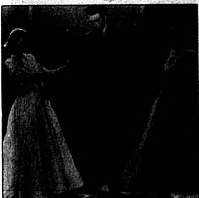
A COUNTRY BOY takes over Broadway is the theme of the screamingly funny Warner Bros. picture "No Time For Comedy" starring James Stewart and Rosalind Russell, scheduled for showing at the Ritz next Wednesday and Thursday. Genevieve Tobin, Charlie Ruggles and Louise Beavers also appear in the fine cast.

Three of Hollywood's brightest stars shine in "Hold Back The Dawn," Paramount's strange and exciting romance which opens tomorrow at the Ritz Theater. The trio, Charles Boyer, Olivia de Havilland and Paulette Goddard, are a guarantee in themselves of super-entertainment. Add Director Mitchell Leisen and Producer Arthur Hornblow, Jr., the men who gave us "I Want to Get Married" and the film becomes an odds-on favorite, sure to justify the rave of preview audiences. Lavishly filmed, the picture's tense drama is lightened by moments of hilarious comedy. "Hold Back the Dawn" tells the story of what happens when a cynical, unscrupulous European man-of-the-world attempts to crash the U. S. immigration barriers by marrying an unsuspect-