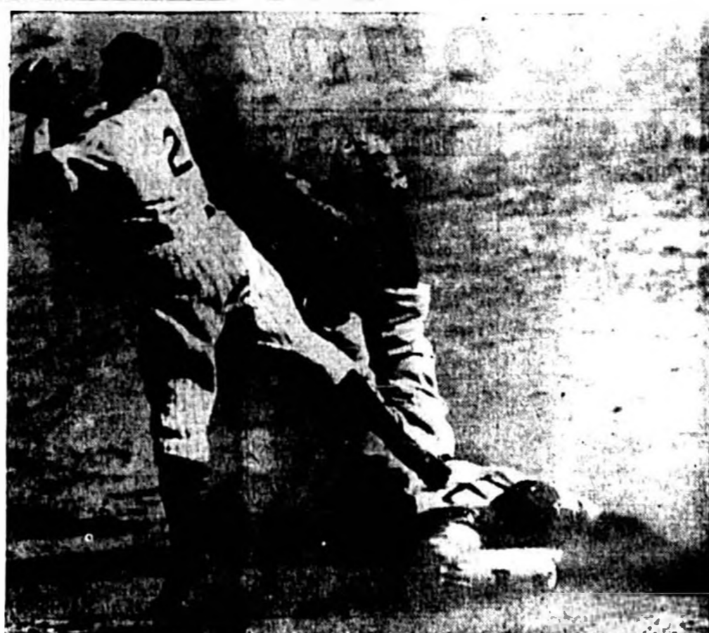
Third baseman Robert (Red) Rolfe of the Yankees is forced out at second base on the right fielder Tommy Henrich's hit to second basekin Billy Herman of the Dodgers in the first inning of the first game of the 1941 World Series at Yankee Stadium, New York.