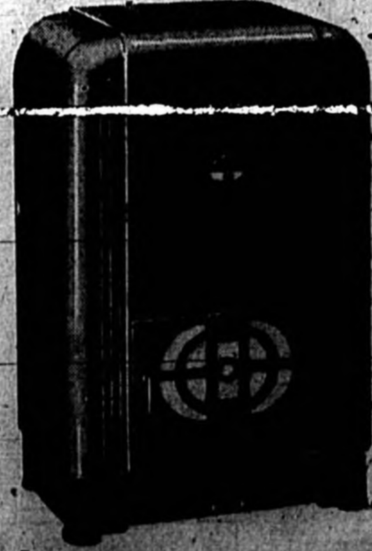
COME IN AND SEE THIS NEW FLORENCE OIL HEATER