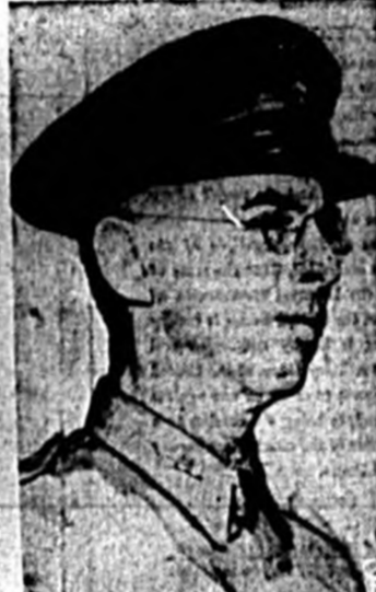
Julian Huxley In the United States on a lecture tour, British biologist Julian Huxley tells New York interviewers "I hope Japan won't back down and you'll have to go to war with her next week." He added that American "ignorance and complacency" in the face of the present world crisis is "amazing."