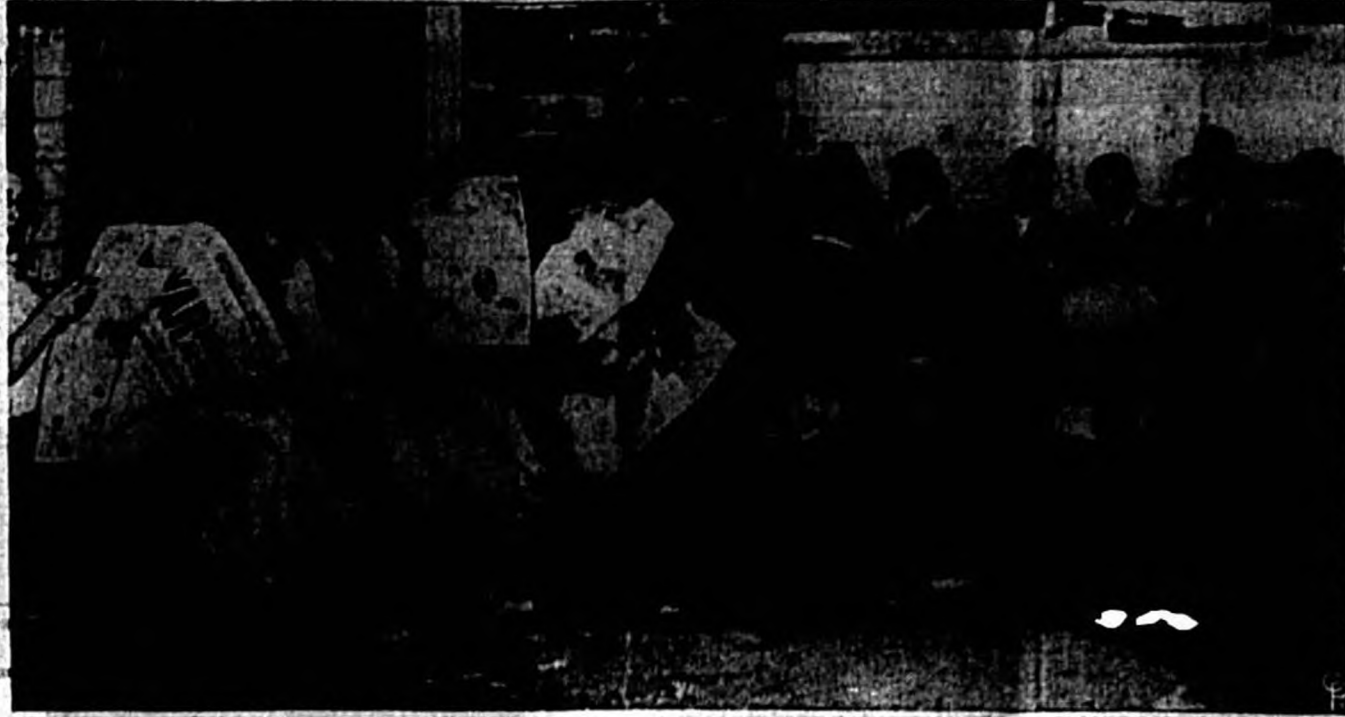
A number of Japanese, just landed from Terminal Island, where there is a large Nipponese settlement, are pictured in the San Diego, Calif. ferry terminal, detained for questioning by agents of the Federal Bureau of Investigation. The Navy has a base on Terminal Island. The move was in line with President Roosevelt's orders for the authorities to place under arrest all aliens dangerous to the state in this emergency.

WASHINGTON, Dec. 11—(AP)—William S. Knudsen said Wednesday that the production goal for giant four-motored bombers had been increased from one month to 1,000, an announcement that underscored the opinion of defense officials that the Pacific war must be won by bombing Japan.