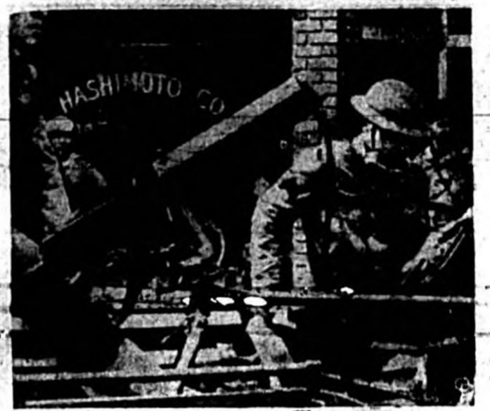
In San Pedro, soldiers bring a machine gun to protect Japanese-owned and operated shops on Terminal Island. All Japanese-populated areas in California have been placed under guard.