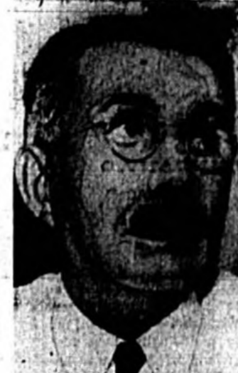
The life of Governor Joseph B. Poindexter of Hawaii was menaced by the Japanese air attack on Pearl Harbor, when a bomb landed near his official residence. Damage to the city was reported heavy.