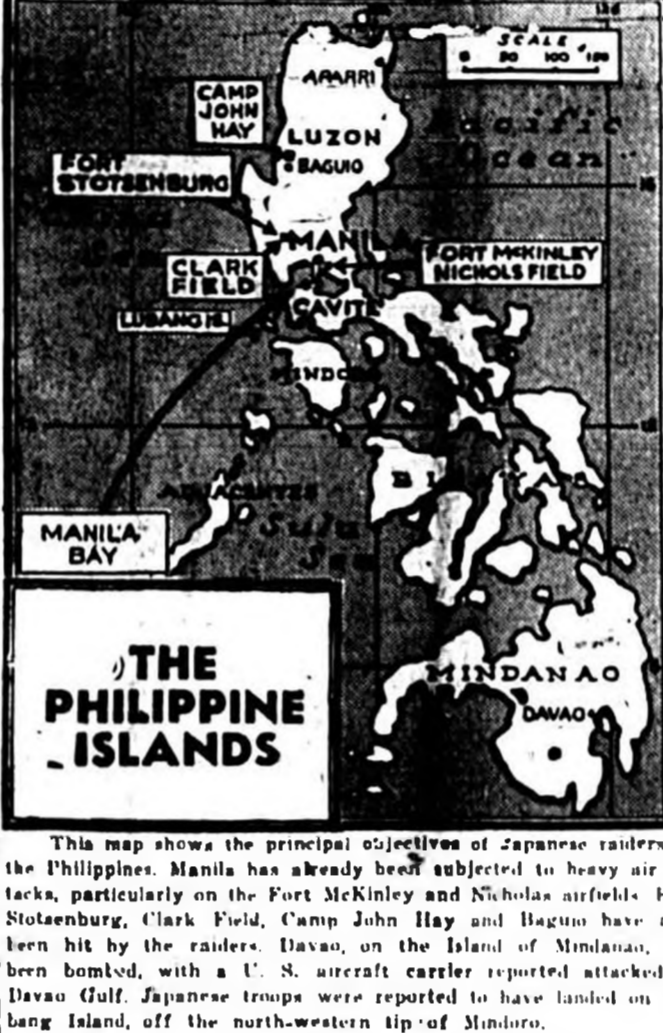
This map shows the principal objectives of Japanese raiders in the Philippines. Manila has already been subjected to heavy air attacks, particularly on the Fort McKinley and Nichols airfields. Fort Stotsenburg, Clark Field, Camp John Hay and Baguio have also been hit by the raiders. Davao, on the Island of Mindanao, has been bombed with a U. S. aircraft carrier reported attacked in Davao Gulf. Japanese troops were reported to have landed on Lubang Island, off the north-western tip of Mindanao.