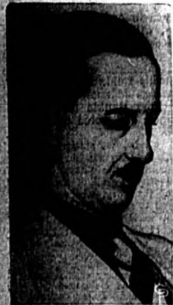
Rep. John D. Dingell A demand that the army and navy institute immediate court martial proceedings against five high ranking officers charged with the defense of Hawaii was asked by Rep. John D. Dingell, of Michigan. He claimed that the army and navy in Hawaii were "slept off guard if they were not sound asleep in bed."