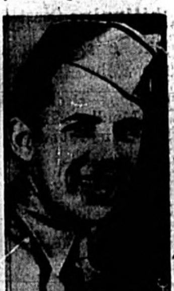
Another soldier portrait with a caption, partially obscured.