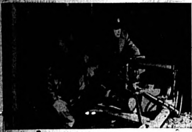
A machine gun unit from Selfridge Field, Michigan, is shown on guard at the Detroit end of the Detroit-Windsor tunnel. Guard was mounted by Canadians on the Windsor side. The precautions were taken after Japan launched the sneak attack on American bases in the Pacific.