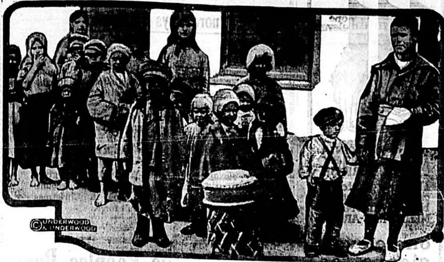
A group of children, deserted by their parents when they could no longer stand the sorry plight of their young, in the Volga district, the center of Russia's starvation area.