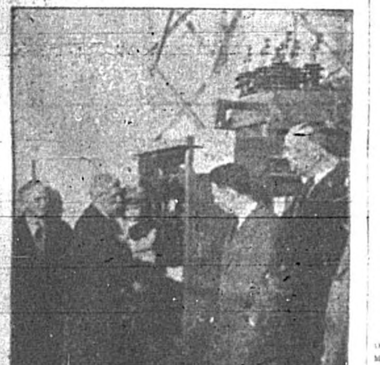
The first load of power was pumped up from a rough run by the new power house after the Ward liner "Havana" went aground at the Florida coast. The picture taken from the ship's deck shows the "Havana" aground at the Florida coast.

WARD LINER "HAVANA" GOES AGROUND IN ROUGH BAHAMAN WATERS