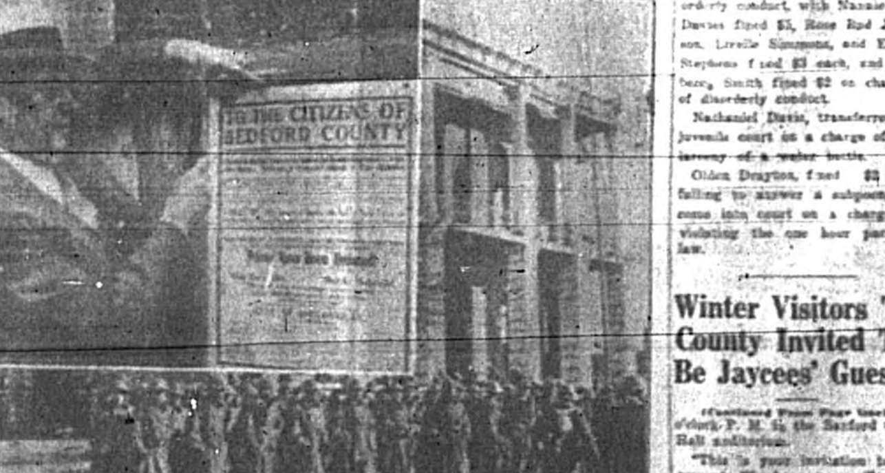
Mobile troops, having restored order to Shelbyville, Tenn., where four civilians were killed in a riot that accompanied attempts to break a strike of bleeding and shipping.