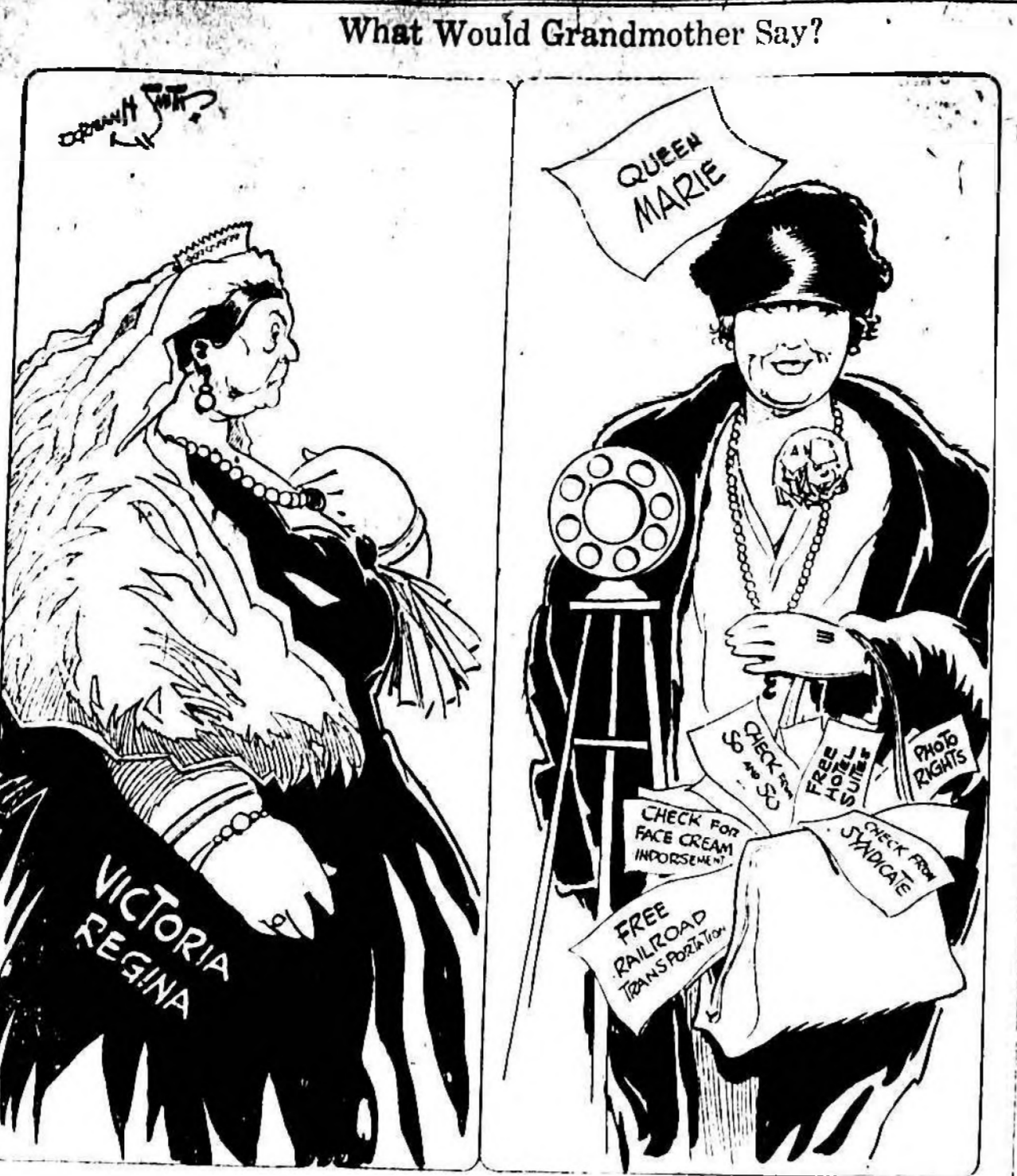
What Would Grandmother Say?

Electric wires are power, and can be sent without wires. It is a matter of one place on the earth will be sent without wires to another place, or sent to machines flying in the air.