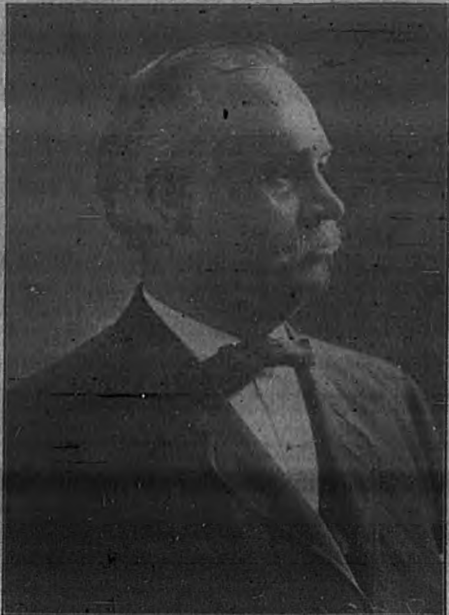
HON. DUNCAN U. FLETCHER

Re-elected as the Senior Senator from Florida in the United States Senate