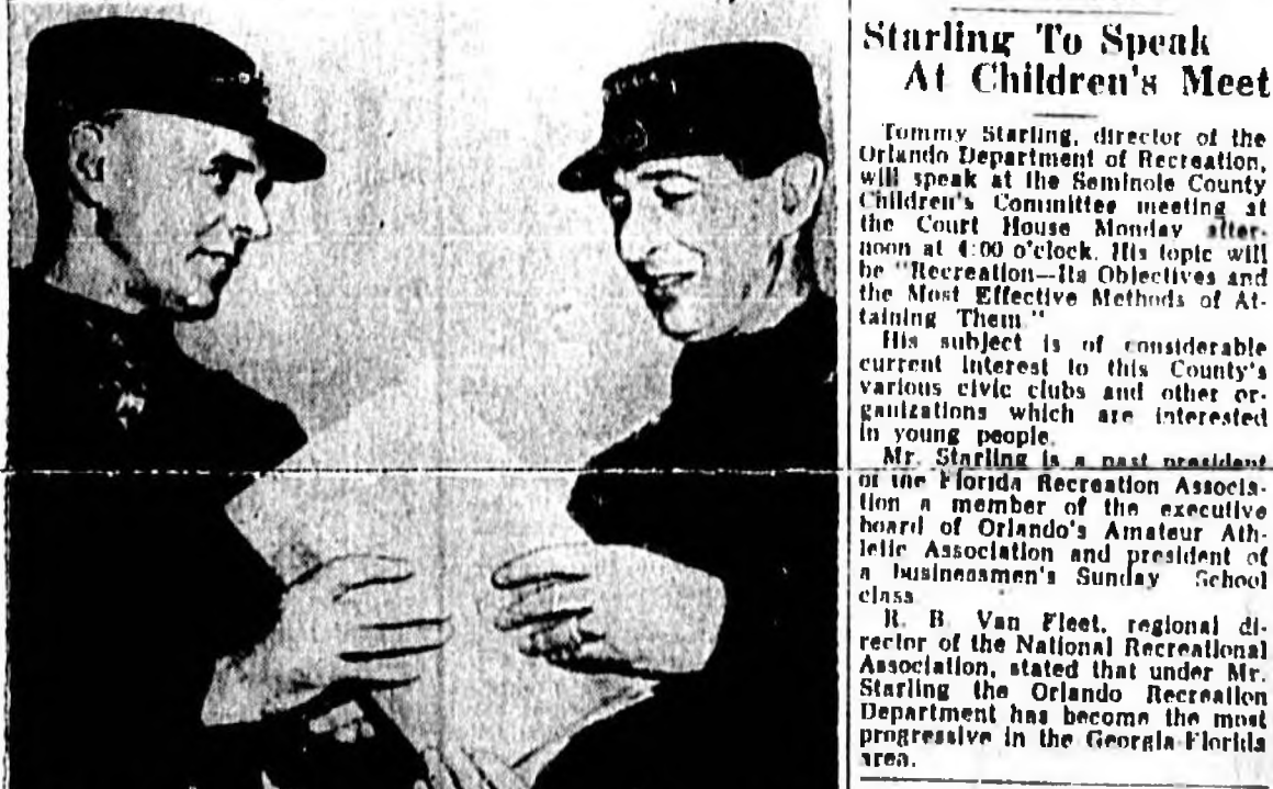
Gen. Mark Clark (right), UN Supreme Commander in the Far East, arriving at Seoul, Korea, hands Gen. Maxwell Taylor, Eighth Army commander in Korea, an envelope which Gen. Clark said contained a new United Nations counter-proposal to be presented to Communist negotiators at the Panmunjom truce talks.

"Man Behind the Gun" 1:45 - 3:45 - 5:45 - 7:30 - 9:30 "Two Dollar Bill" 7:05 - 8:15 complete show 9:30