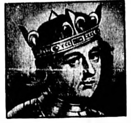
Contemporary portrait of Richard I, and an old coinage of him leading his knights to the Third Crusade.