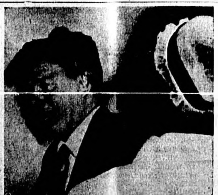
Arthur Godfrey, radio and TV star, entered the operating room at Massachusetts General Hospital today for surgery to correct his hernia suffered in an automobile accident. In its regular bulletin this morning the hospital said "Godfrey is in the operating room now, to be operated on this morning." The hospital has announced it will issue only two bulletins a day.