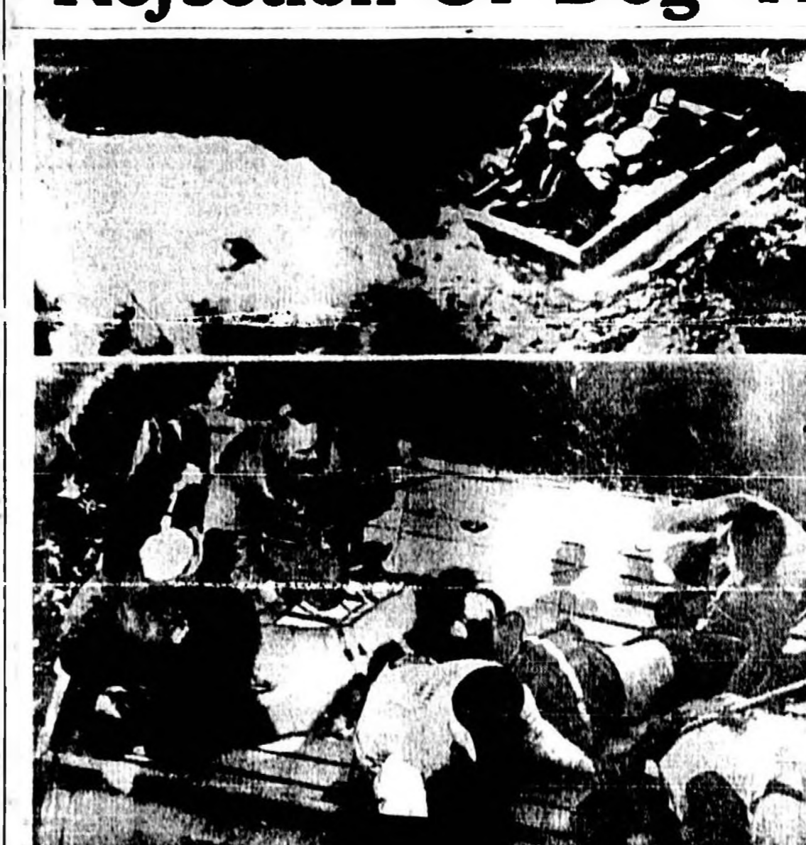
Made from a rescue ship, these tonally dramatic pictures show survivors of the ill-fated Great Lakes freighter "Honey Bee" clinging to a rock and sank off Isle Royale, Mich., with a loss of 17 lives. Some of the fishermen who were shot are shown (top) off a life raft as they awaited the rescue vessel, "Joseph H. Thompson." At bottom is a close-up of the survivors as one of them (right) was tying a tone around a fellow sailor so that he could be hauled to safety.