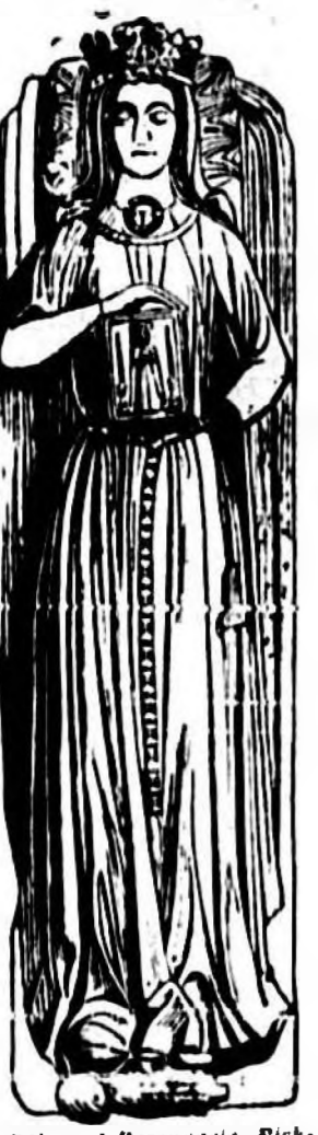
Queen of Berengaria, Richard's queen who never saw England. She was Spanish.

No. 7: Richard I "the Lionhearted." Ruled England 1189-1199. Born 1157, third son of Henry II, whom he forced to make him the heir. Richard became one of the worst English kings. An English historian says he entered a higher reputation in later years than he ever merited. Arrogant, cruel, treacherous and suspicious, he was 25 when he was crowned. Two years after being crowned, he began the Third Crusade and thereafter he was preoccupied with military expeditions. England realized one gain from his negligent and costly reign. In order to obtain funds for his expeditions and also for his ransom when he was captured in Austria, Richard's ministers sold civic franchises, trading rights and other grants to the guilds and mercantile corporations, and enabled a powerful middle class of merchants and tradesmen to rise in England.