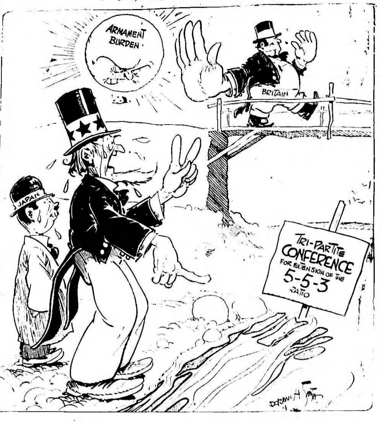
WINE CELLAR OF THE LATE J. B. DUKE

THEY ARE ALL HERE... They are all here, but they are not all what they seem to be.