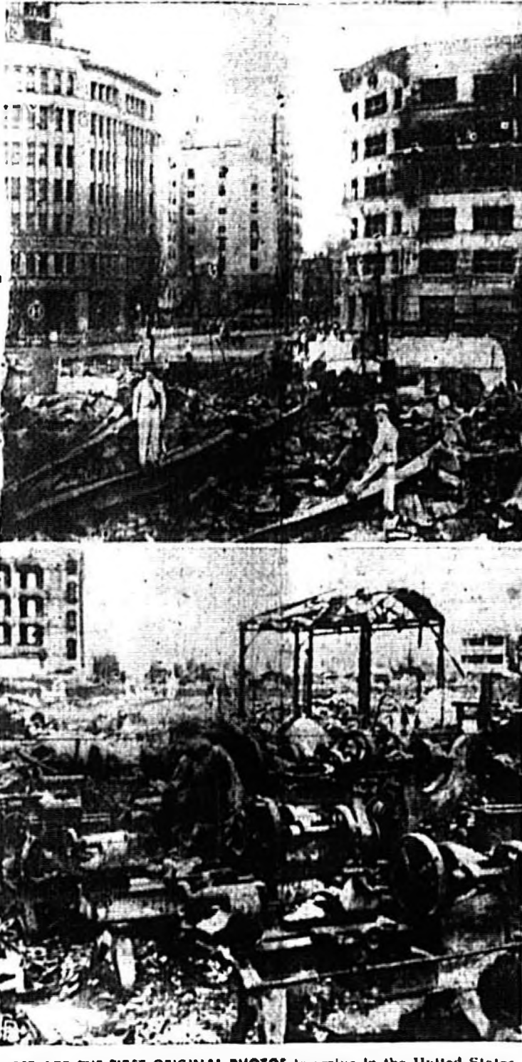
THESE ARE THE FIRST ORIGINAL PHOTOS to arrive in the United States showing the damage our B-29 bombers inflicted on the Jap capital.

These are the first original photos to arrive in the United States showing the damage our B-29 bombers inflicted on the Jap capital. The top picture shows the Ginza area, Tokyo's "Fifth Avenue," after a visit by some of our Superfortresses. It is a mass of twisted girders and broken masonry. Bombs leveled buildings that were in the foreground and fire blackened the walls of the structure across the street. All that is left of the factory (bottom) in the Jap capital is the machinery on the main floor. The rest of the building was burned to the ground by American incendiary bombs dropped from "Fortys".