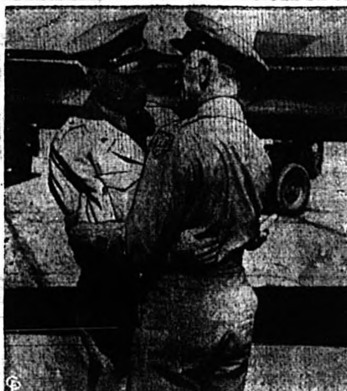
COMMANDER IN CHIEF of the U.S. Army Air Forces, Gen. Henry H. Arnold (left), warmly greets Vice Admiral Carl A. Spaatz, commander of the U.S. Strategic Air Forces, as the latter arrives at Hamilton Field, San Francisco, from his headquarters in the Pacific. Spaatz commanded the Strategic Air Forces in both Europe and the Pacific theater.