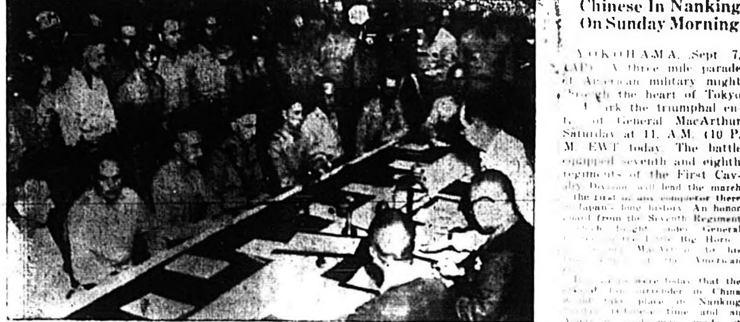
THIS IS THE HISTORIC SCENE at Baguio, P. I., where General Tomoyuki Yamashita, commander of all Jap forces in the Philippines, and General Douglas MacArthur, commander of the United States Forces in the Philippines, are signing the agreement for the surrender of the Philippines to the United States. General MacArthur is on the right, General Yamashita on the left. Other officials are visible in the background.