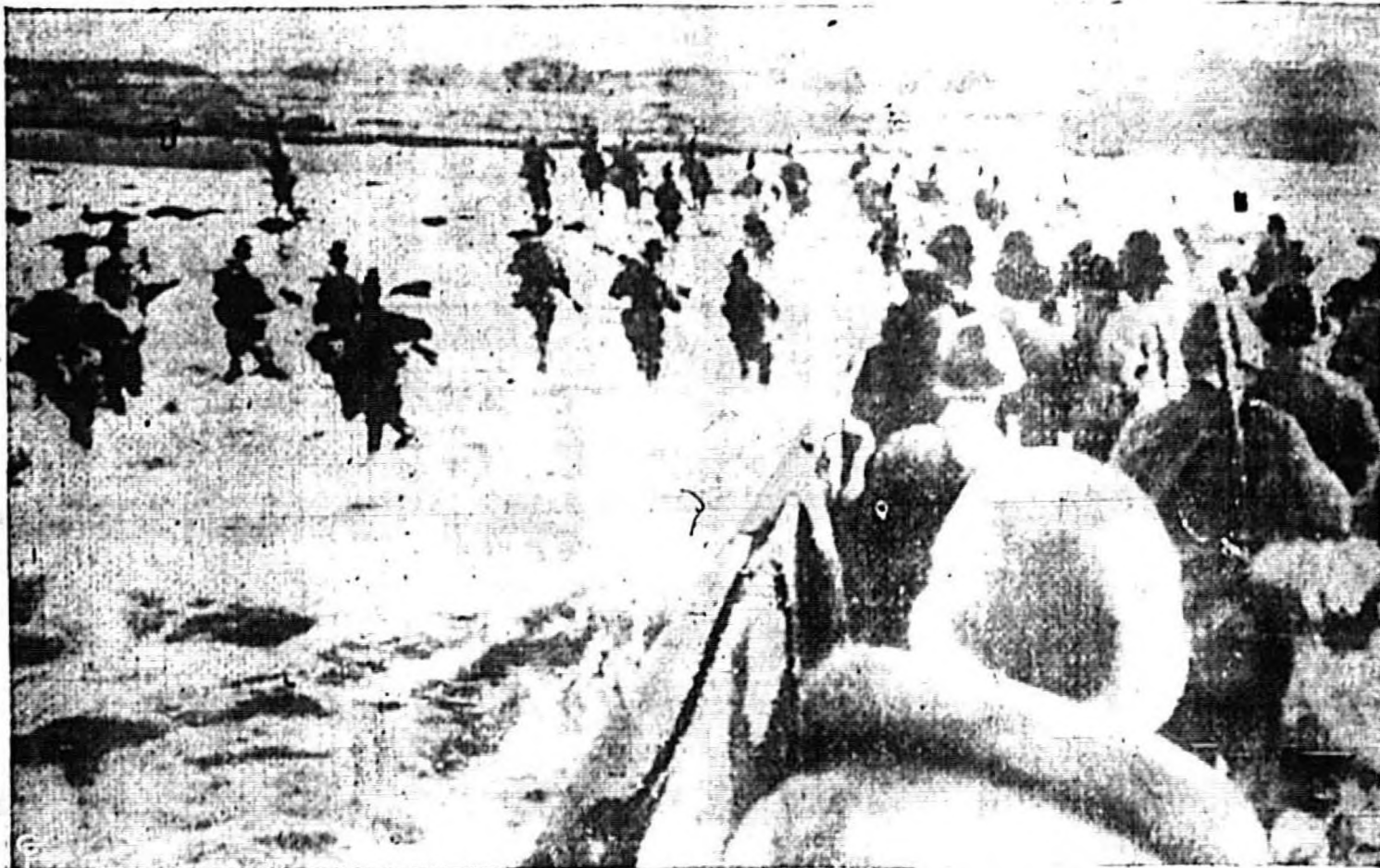
Despite the lack of enemy gunfire, the first American Marines to land in Japan storm ashore through the surf on to Futaba Saki Peninsula. As they hit the beach they carried full combat packs and weapons.