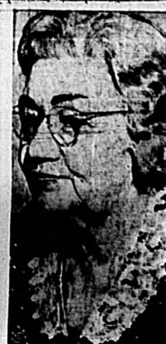
Christmas greetings transcribed on a borrowed recording device...