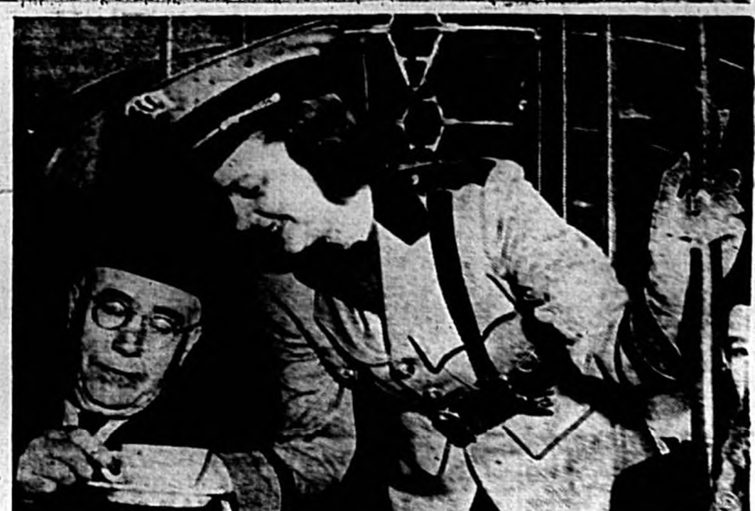
Hustlers for street cars have been put on duty by the Birmingham Electric Co....