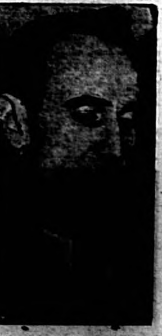
"I'm so sorry that you're married and that you have these children..."