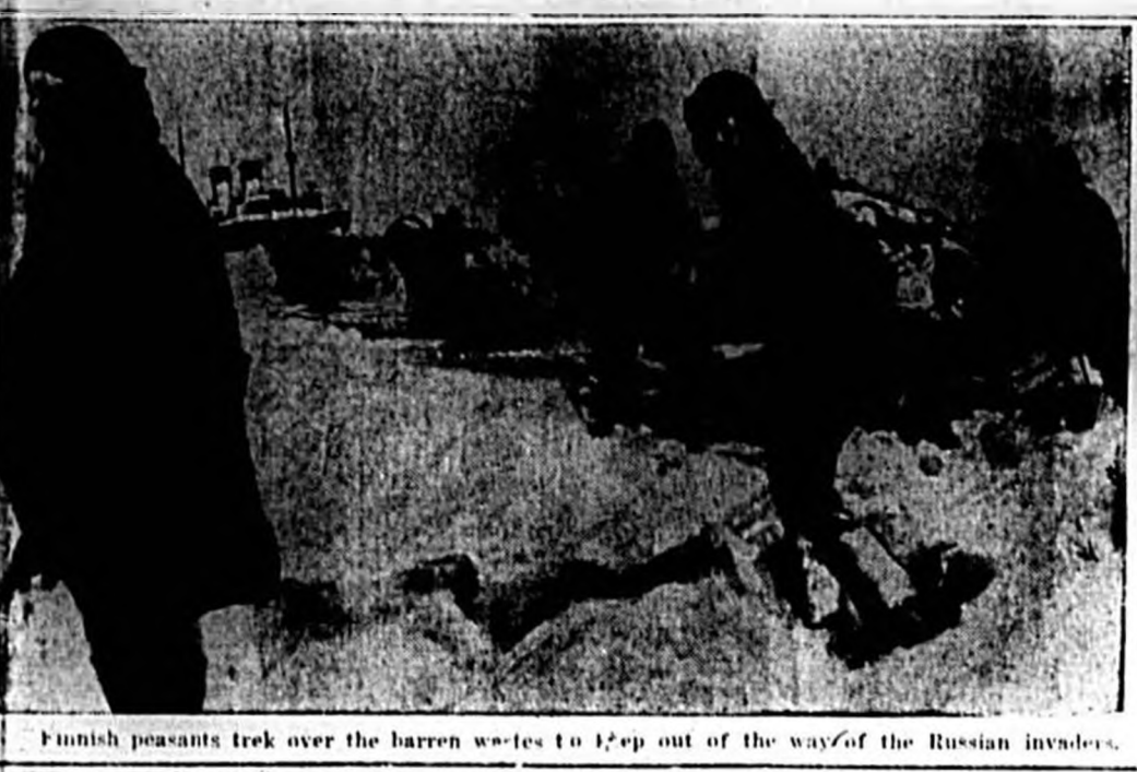
Finnish peasants trek over the barren wastes to 17,000 ft. out of the way of the Russian invaders.