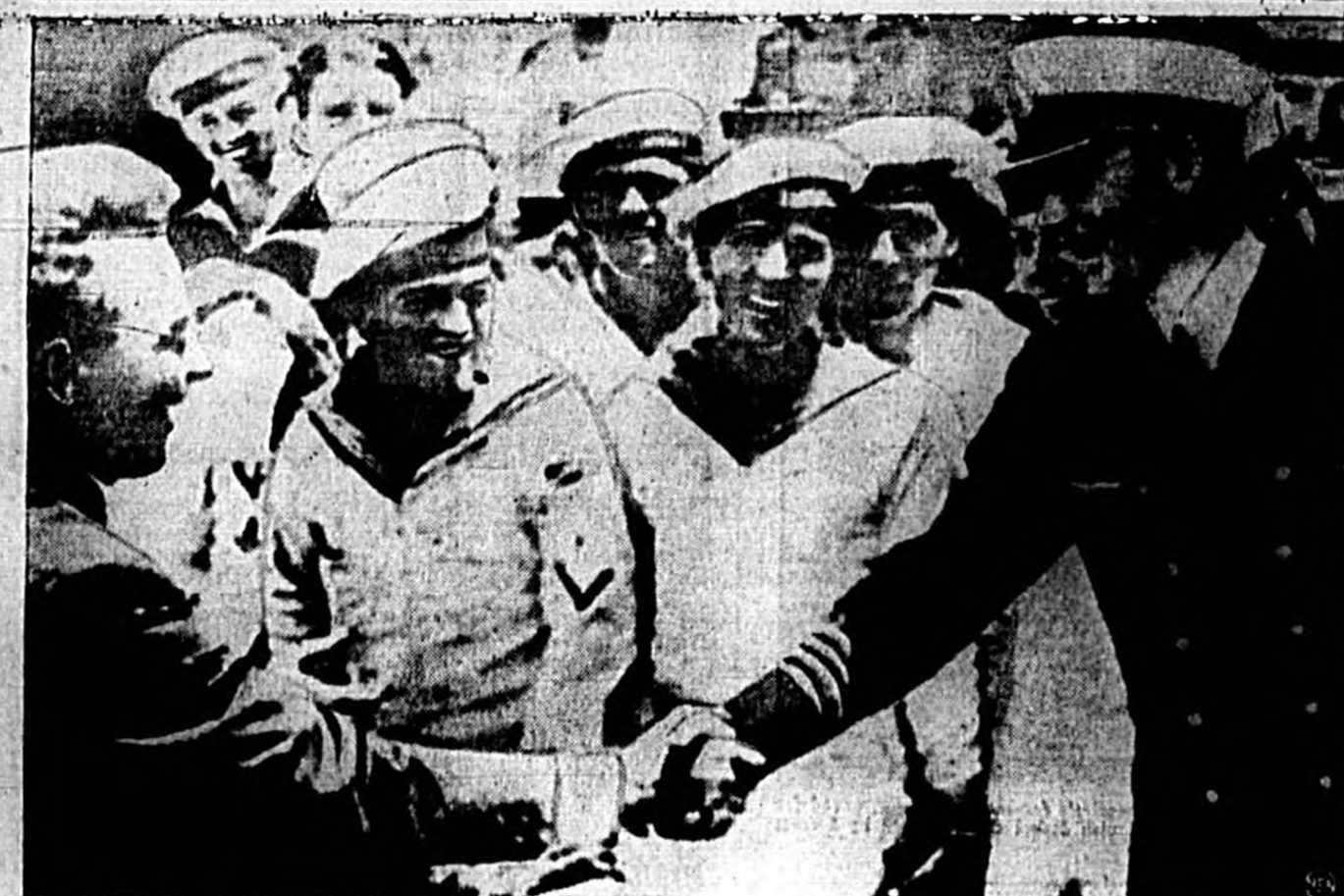
Admiral Graf Spee's sinking in the mouth of the River Plate...