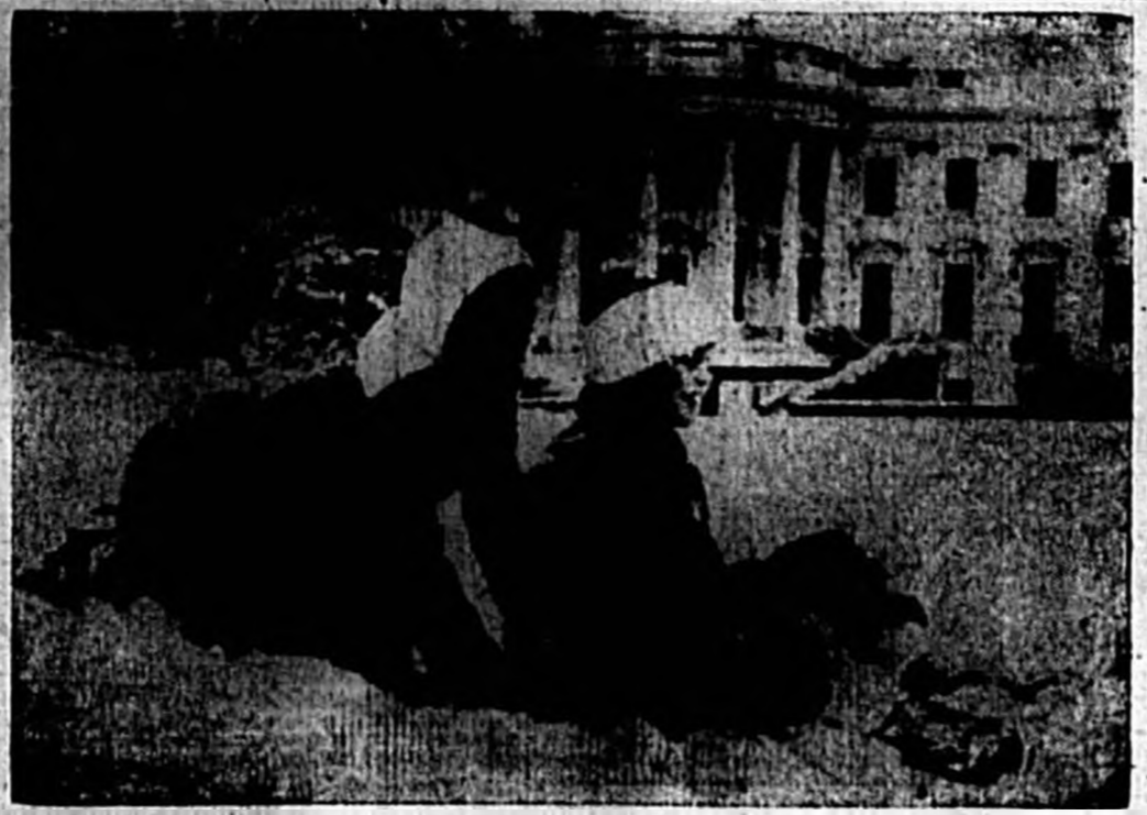
Winter falls on the United States; the "just low" is covered with between nine and 18 inches of snow...