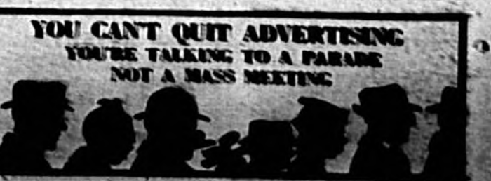
YOU CAN'T QUIT ADVERTISING YOU'RE TALKING TO A PARABE NOT A MASS MEETING