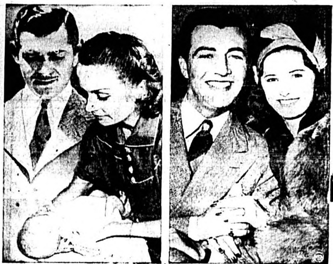
HOLLYWOOD IS regarded as a couple of sudden snouts over the president rumor...