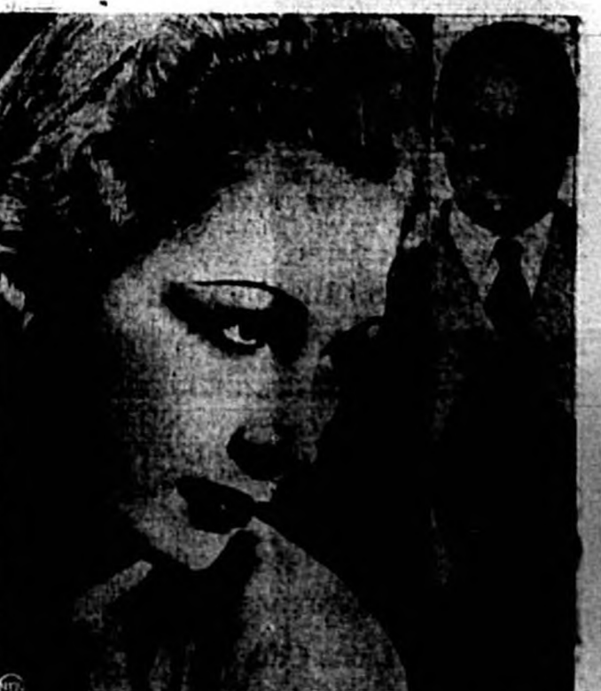
"I'm so sorry that you're married and that you have these children..."