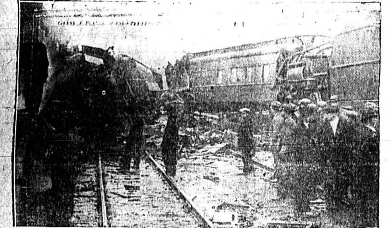
When the fifth section of the Twentieth Century Limited, crack flyer of the New York Central, was being backed out of the Chicago depot yards the in-bound sixth section, traveling at a high rate of speed, crashed into it. Three persons were injured, one probably fatally, and scores of passengers were shaken up. Debris was scattered over four tracks. At the right of this picture can be seen the engine off the sixth section jammed into the rear Pullman of the fifth section.