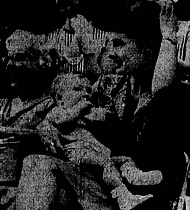
THINGS ARE DIFFERENT—What happens to former beauty queens? They marry and become mothers. At least, that is what Jackie Mayers, the former Miss America, did. Here she is at Cedar Point, Ohio, with her young son and her mother, enjoying the Miss Ohio contest in which she participated three years ago.