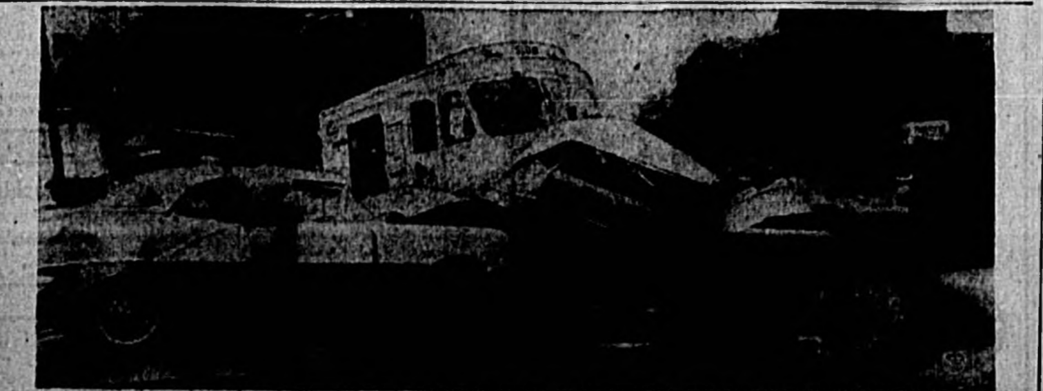
WHEN THEY say "auto pileup," this is what they mean. The Chicago pileup smashed three autos and two trucks and was a chain reaction of events set off by the truck (center) whose driver blacked out. Six were hurt.