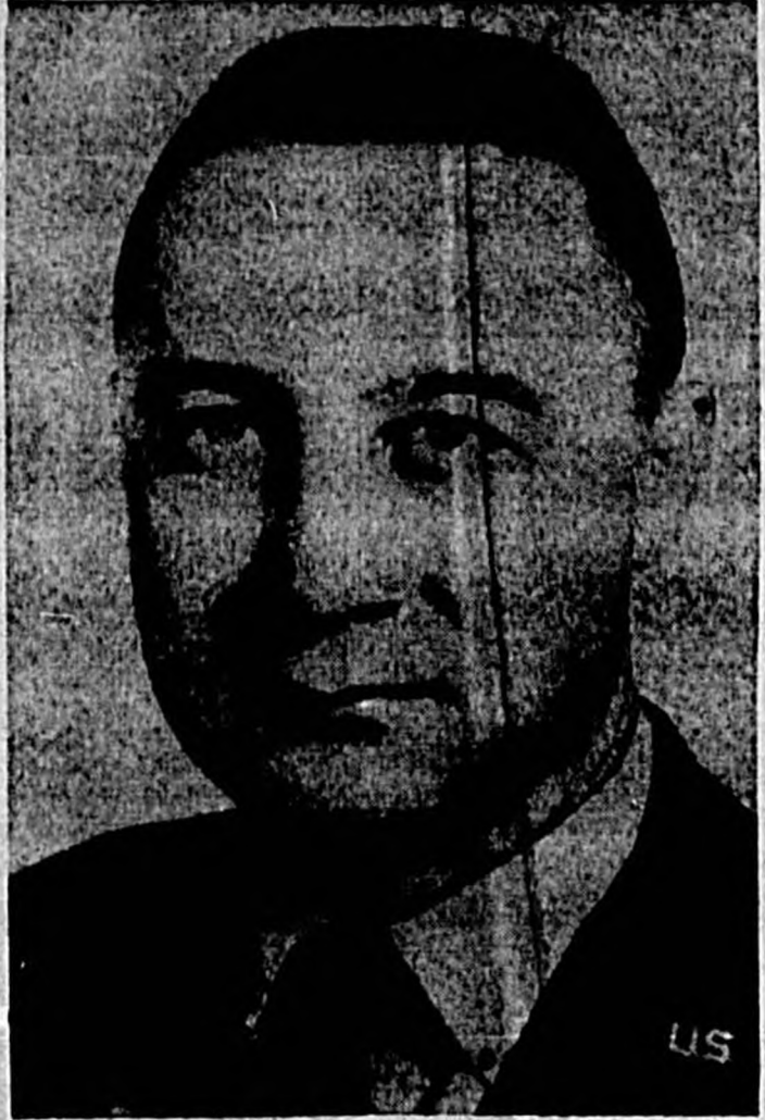
Capt. Virgil Grissom