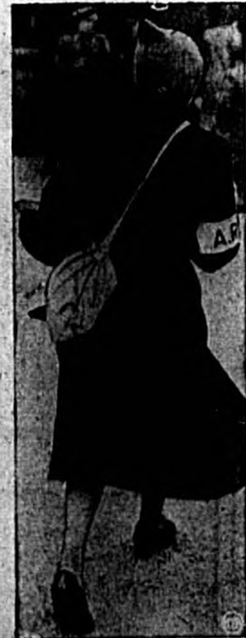
SPECTATORS AT the Grand National Steeplechase at Aintree, England, usually burn out as much for the great fashion display as for the race. But this year they saw many a disquieting "style note"—such as appears above. Three hundred women Air Raid Precautions wardens, equipped with gas masks and helmets, were on hand—just in case.