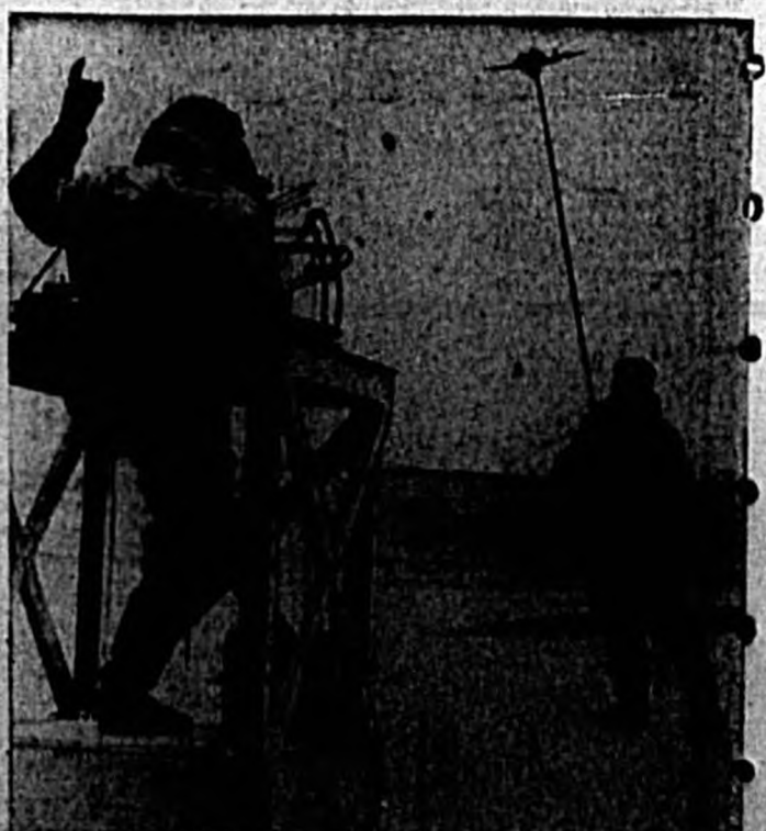
Carrying aloft a 100-hp model of a German Messerschmitt fighter plane, one Royal Air Force aviation student waits around... (Caption text is mostly illegible.)