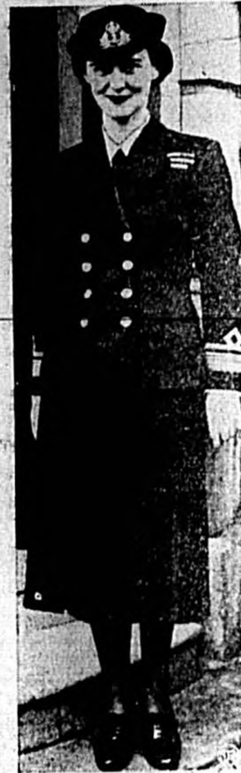
The Duchess of Kent's wartime garb of sterner cut but no less smartly worn. The duchess is shown in her uniform as commandant of the women's Royal Naval Service.