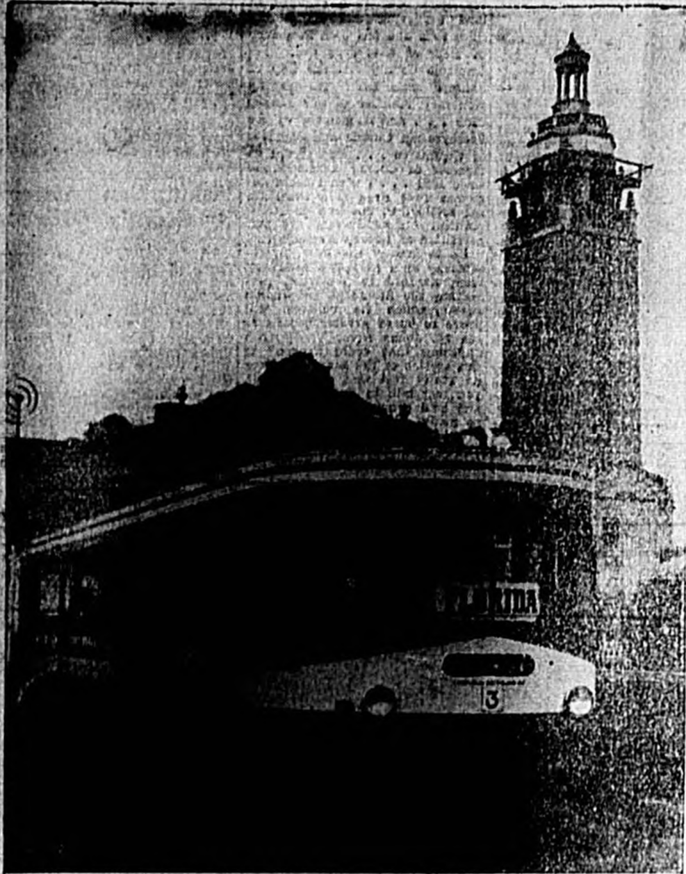
NEW YORK.—Grayhound buses are getting ready for the opening of the 1940 World's Fair, Saturday, May 11. The illustration shows one of them in front of the Florida pavilion which also is being put in readiness for the opening. Buses operating throughout the grounds and into the Florida area, this year will carry a sign such as is shown in the above photograph. Florida is the only state or governmental exhibit thus honored. No need for anyone seeking the Florida buildings, this year, to fail to find the right bus.