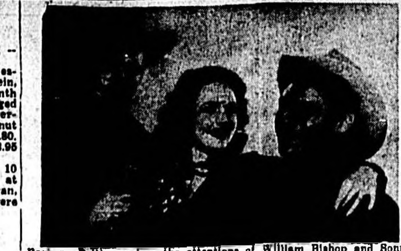
Barbara Britton enjoys the attentions of William Bishop and Sonny Tufts in Columbia's "THE UNTAMED BREED," showing at the Ritz Theatre Thursday and Friday.