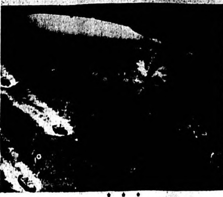
THE PRIDE OF THE FRENCH merchant fleet, the Ile de France majestically sails up New York harbor escorted by fireboats and a U. S. Navy blimp.

NEW YORK Aug. 2—(AP)—People sometimes say: "The only way you can get in the newspapers is to hold up a drugstore or slope with a movie star."