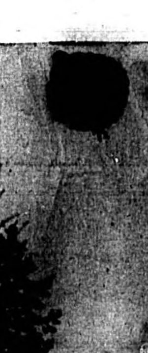
A new type parachute harness, padded and shock-proof, has just been developed by the U. S. Army. It is being used by the U. S. Army to drop its paratroopers in new U. S. effort to check the Russian advance.