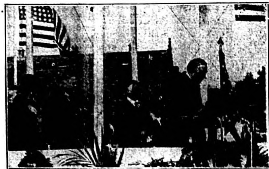
A distinguished throng, including the President and Mrs. Hoover, attended the unveiling of the Titanic Memorial in Rock Creek Park, Washington. The monument was unveiled by Mrs. Wm. Howard Taft, wife of the former President. Left to right, Mrs. Taft, Mrs. Hoover and Secretary of State Stimson.