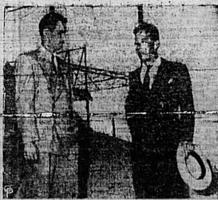
A MEMBER OF THE SENATE War Investigating Committee, Sen. Harry Cain (R-Wash.), is shown with plane builder Howard Hughes (left), who took the Senator on an inspection tour of his plant at Terminal Island, Calif. After inspecting Hughes' $10,000,000 flying boat, Cain said: "If it flies, it will have achieved the impossible in our lifetime. If we had something like this during the war, even on the ground, it would have scared the enemy to death."