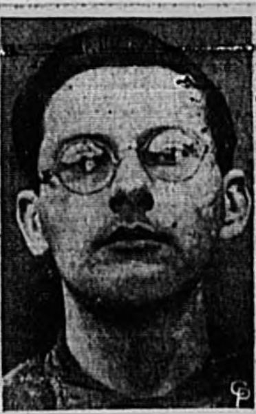
ADOLF HITLER'S personal physician, Dr. Karl Brandt (above), and 14 other defendants were found guilty by a United States tribunal in Nuremberg, Germany. They were tried on charges of participation and responsibility for medical experiments on the inmates of concentration camps.