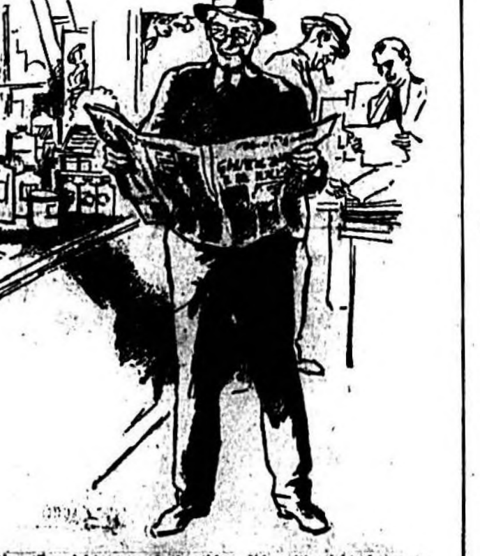
"Judge, I didn't realize till the other night when I ran across an article in the paper what a whole of a lot of industrial alcohol the government needs for the war..."