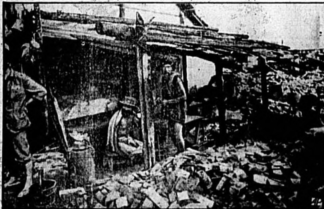
CIVILIZATION STEPS BACKWARD as war strides ahead. This was the scene of utter desolation left by a series of Japanese bombing raids on the Nantao "slums" of Shanghai. Half clothed, forlorn, appearing like prehistoric cave men, these Chinese have built themselves a crude shelter amid the ruins. Charred timbers show evidence of the fire which followed the aerial attacks.

AT THE RITZ Sunday, Monday—The greatest adventure romance of the sea ever filmed—Gary Cooper and George Raft in "SOULS AT SEA." Tuesday—THE BIG EYE—275 Special Added Attractions and "THE ROAD BACK." Wednesday, Thursday—Loretta Young, Virginia Bruce, Warner Baxter "WIFE, DOCTOR AND NURSE." Also Judith Barrett, William Gargan "BEHIND THE MIKE." Friday—Fay Wray, Richard Dix "IT HAPPENED IN HOLLYWOOD." Also return showing, Bette Davis, Edward G. Robinson "KID GALAHAD." Saturday—Otto Kruger, Douglas Montgomery, Jacqueline Wells "COUNSEL FOR CRIME" and Johnny Mack Brown "GAMBLING TERROR." AT THE PRINCESS Saturday Sunday, October 2nd and 3rd—Bob Steele, "THE GUN RANGER" and "SWEETHEART OF THE NAVY."