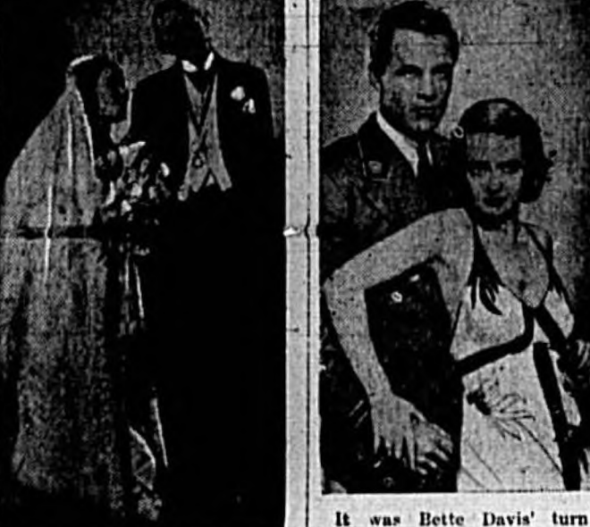
It was Bette Davis' turn to take a rap from love—after scoring screen devotion in a dozen pictures—and how she takes it in the form of Wayne Morris, 6 feet three inches of fighting manhood, in "Kid Galahad."