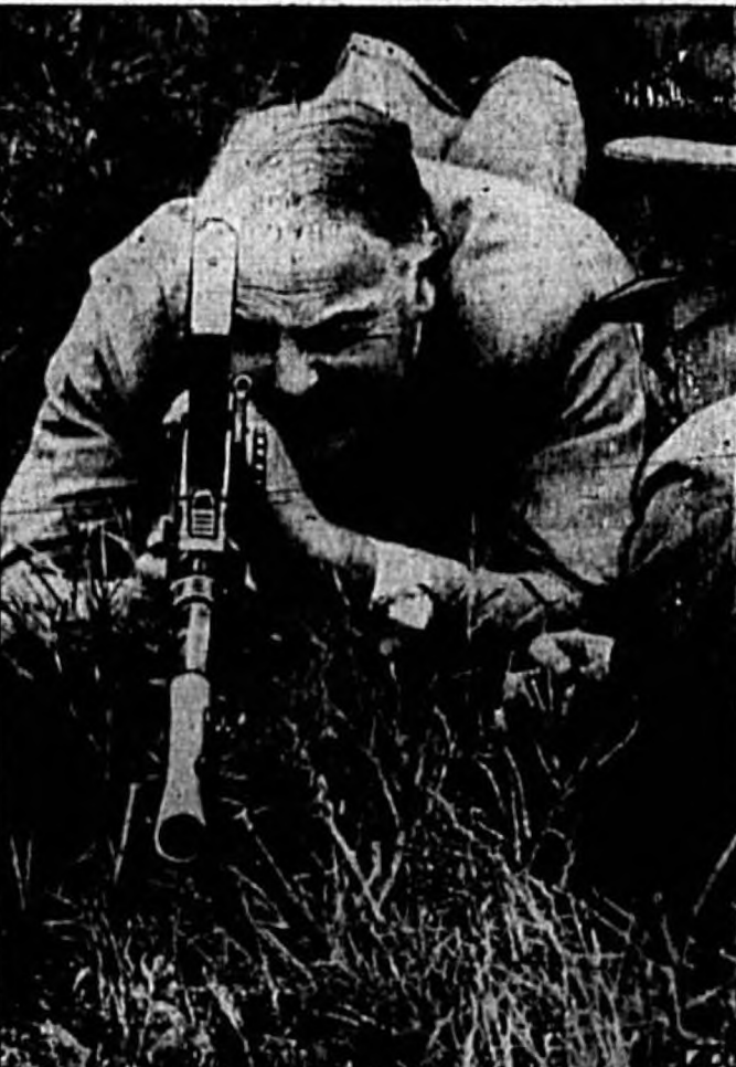
IT'S JUST A GAME, but one of deadly seriousness, that is played by Great Britain's army in its annual war maneuvers. Here is War Minister Hore-Bellina trying his hand at the new Sten machine-gun on a visit to mimic battles held in Essex, England. These war games give English Tommies the experience necessary for top British Army.