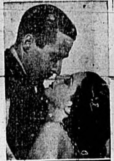
A legal love affair, so to speak, develops between Douglas Montgomery and Jacqueline Wells, his lovely office helpmate, in Columbia's "Council for Crime," at the Ritz Theater Saturday. Montgomery is seen as a fighting prosecutor.

The earliest known express service was organized in 1826 to operate over the Boston-Taunton "railway."