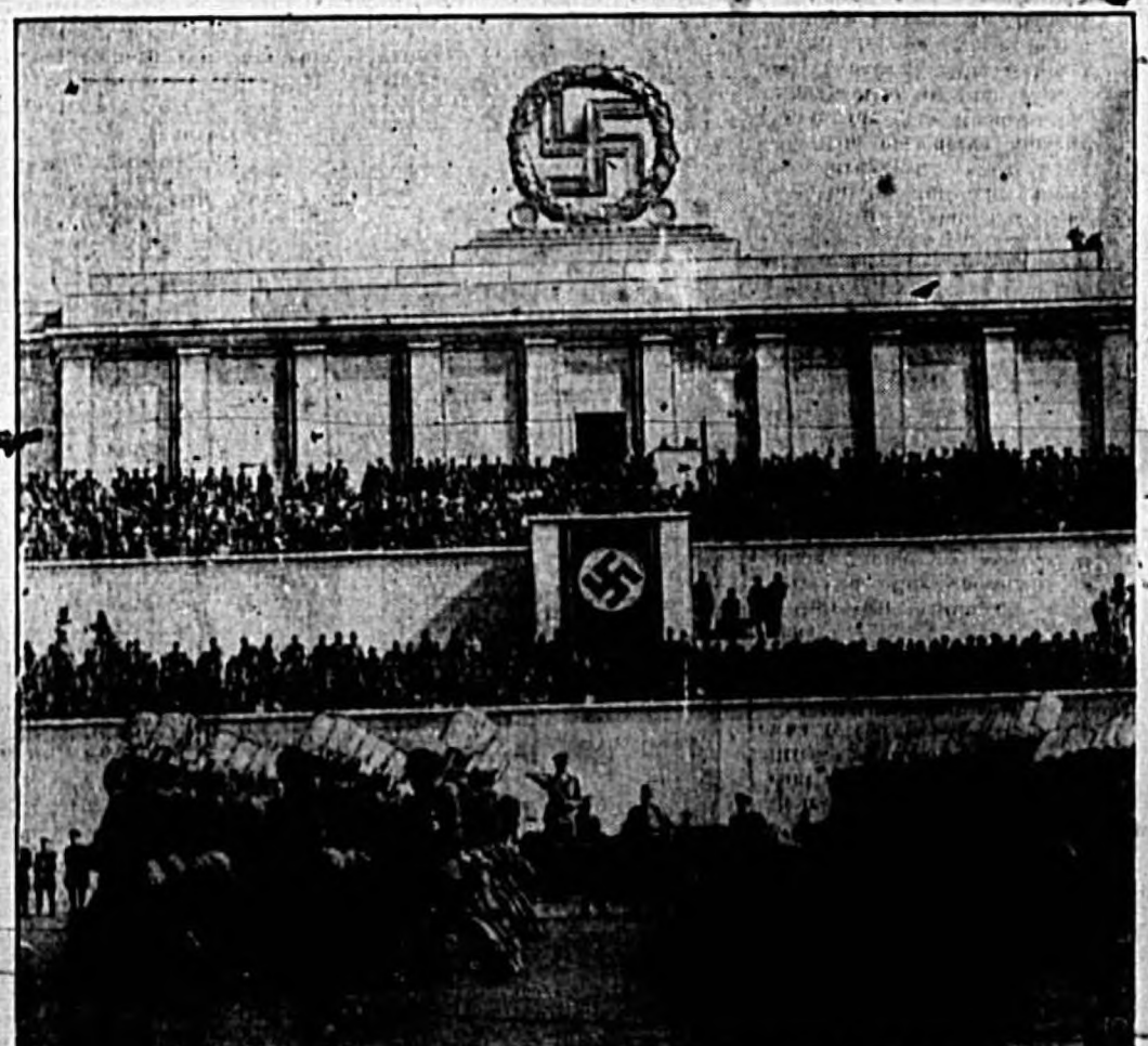
THE AGE OF SPADESMEN. Germany's labor service workers, 22,000 strong, escorted recently past Fuehrer Adolf Hitler at the Nazi party convention in Nuremberg. For two hours the Nazis paraded past their chief and stands crowded with high officials of the Reich. Following the convention Germany opened war games in the greatest martial display since the Armistice.