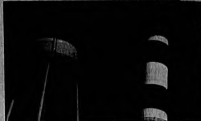
A view of one of the smokestacks at the Florida Power & Light plant.