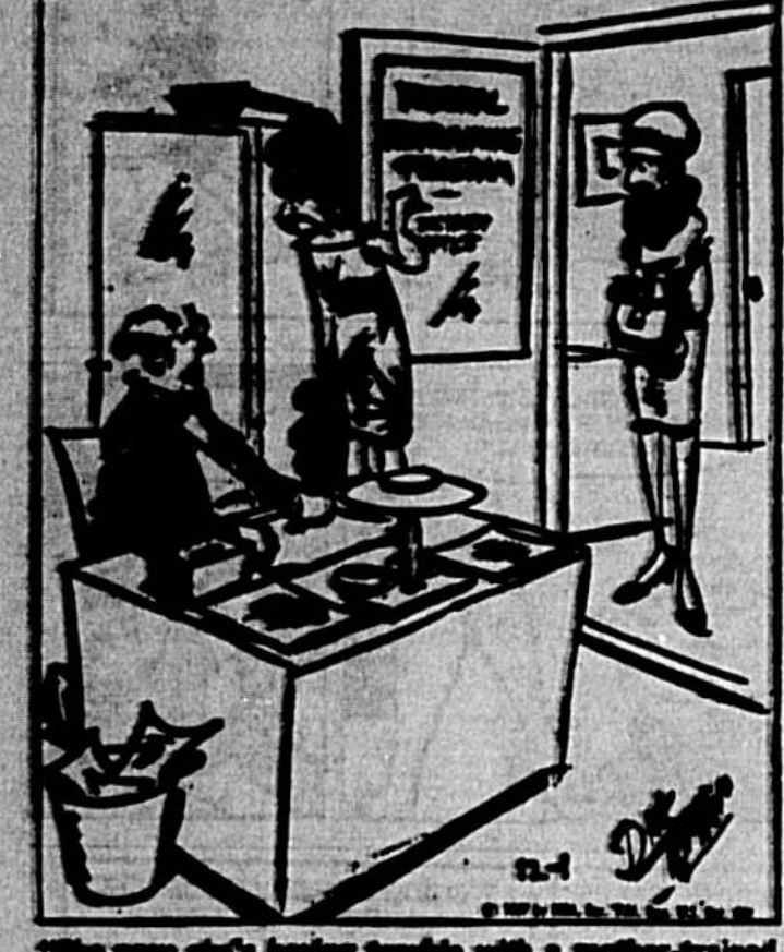
By Dick Turner