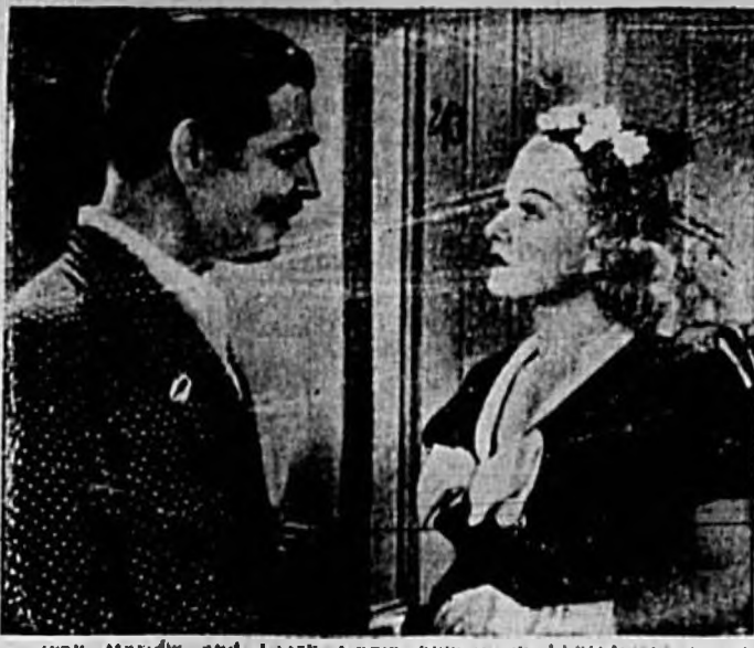
Jean Harlow and Clark Gable appear in "Saratoga" at the Ritz Sunday and Monday. The last production of the famous platinum blonde was completed with the use of a "double" and the aid of trick camera shots.