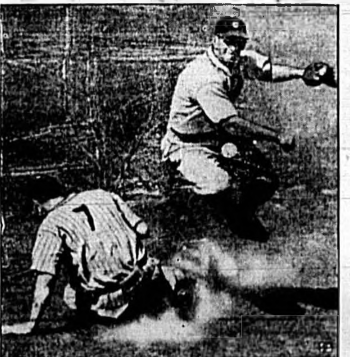
DOING 'THE BIG APPLE' is the latest dance craze of the south, but it seems to have gotten into the blood of Shariatap Appling of the Chicago White Sox. What he's really doing is tooting to and after putting out Hal Trosky of Cleveland who vainly slid for second base.