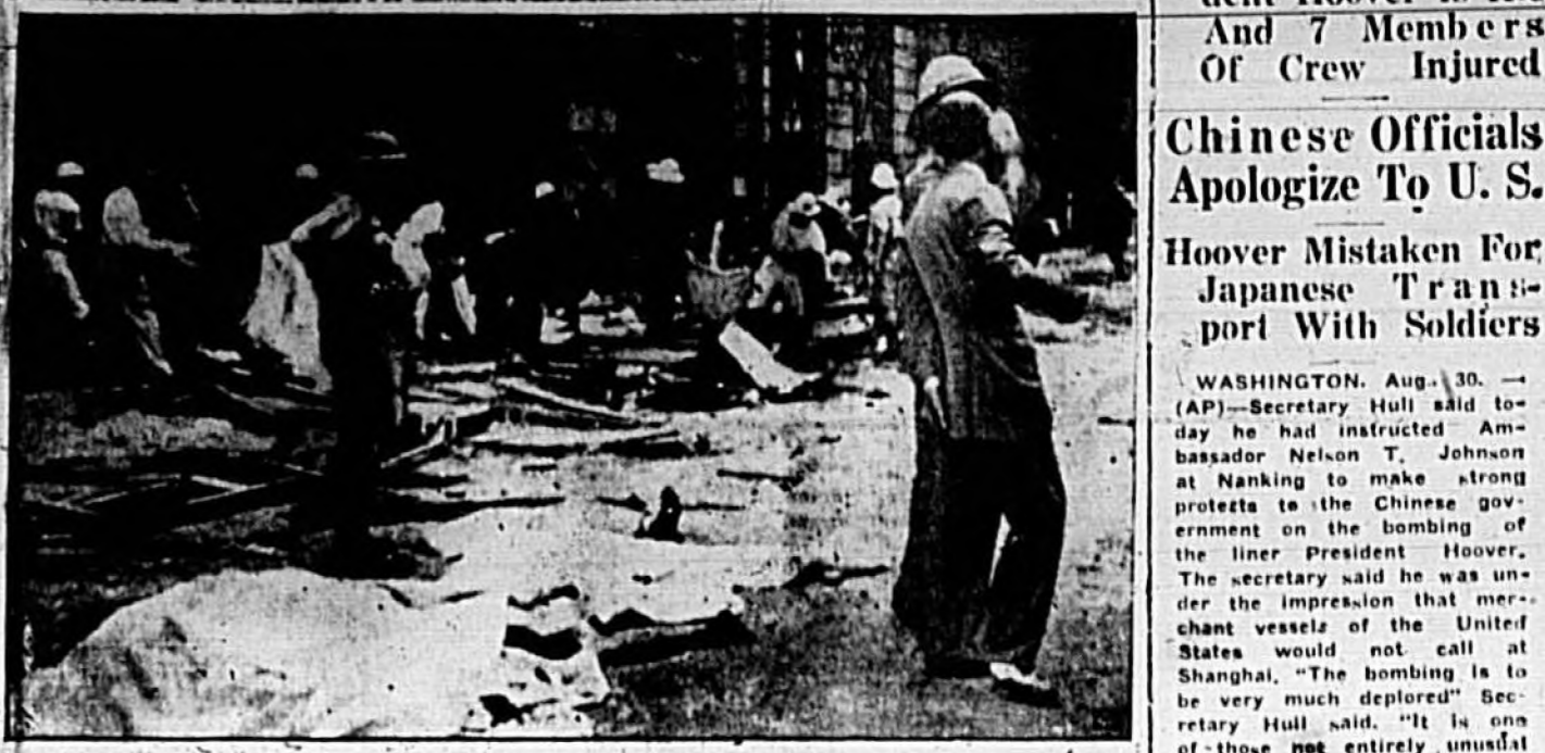
They also serve who live to clear the streets of carnage. This was the scene in Shanghai after bombs plunged into crowded Nanking road in front of the Palace hotel. Hundreds died and hundreds more lived to suffer the agony of wounds. Those who escaped removed the dead and injured, as depicted in this copyrighted Associated Press photo taken by Clippier. Aerial destruction was carried out on a scale seldom equalled in the history of war.