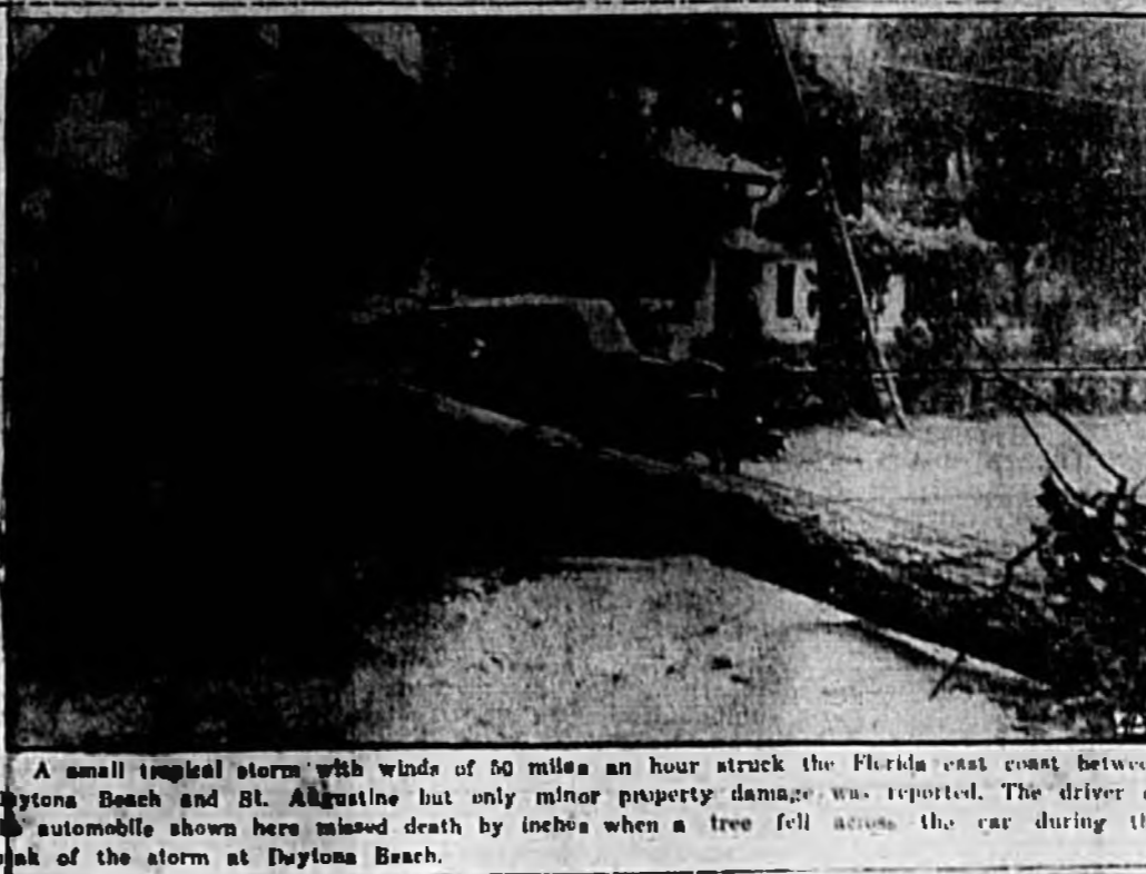
A small tropical storm with winds of 50 miles an hour struck the Florida east coast between Daytona Beach and B. Augustine but only minor property damage was reported.