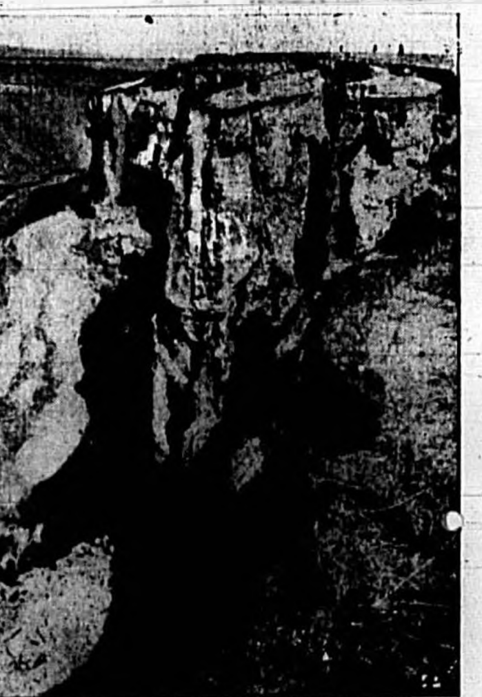
CROP CONTROL on a wholesale basis with old "Mother Nature" herself plowing under acres of a field in being reclaimed by farmers near Buhl, Idaho. A whole valley is making, scrambling away fertile lands. Tiny figures (above) show the size of the gorge. Experts seem baffled by the phenomenon.