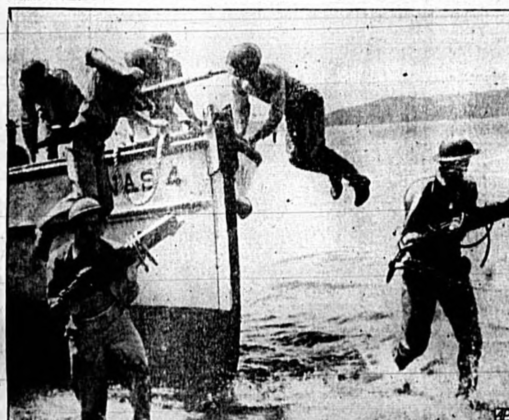
THE YANKS ARE COMING , was the cry 20 years ago in the "war to end all wars," and today American troops are again headed across the sea. This time it's the Marines, ordered to Shanghai to protect American lives. Members of the sixth regiment, machine-gun battery, went through landing drills before departing from San Diego for the scene of Sino-Japanese hostilities in China. This propaganda keeps them in shape for possible eventuality there.