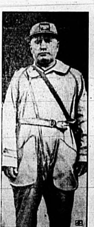
NO NIGHTSHIRT is this strange-looking garb worn by stern-faced Premier Mussolini, but a miner's outfit he donned in Sicily.