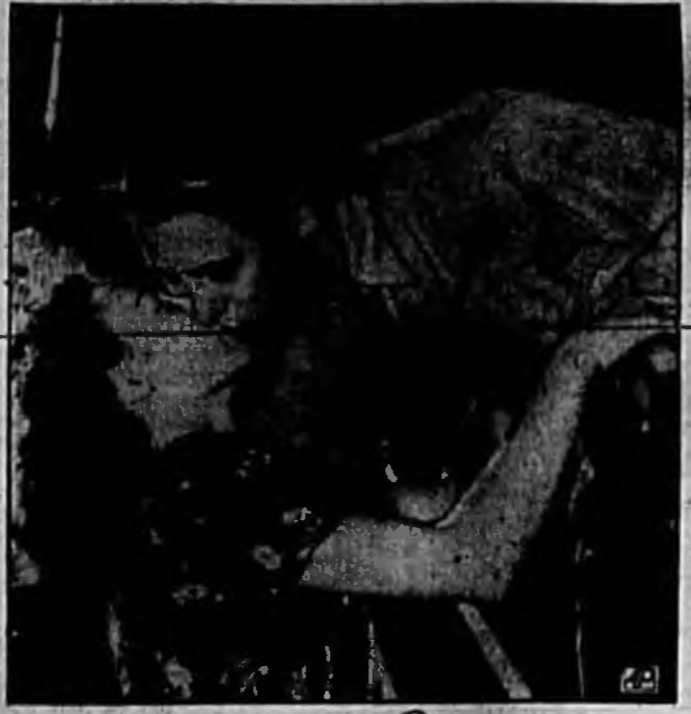
In scenes reminiscent of World War days, United States Marines sailed from San Diego, Calif., to assist forces already in Shanghai protecting American citizens and property.