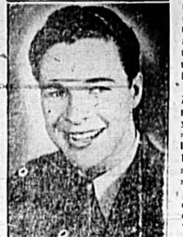
Kenny Baker, comical Warner Brothers star, demonstrates his prowess in acting and singing in the humorous "Mr. Dodd Takes the Air," which plays at the Ritz Tuesday.