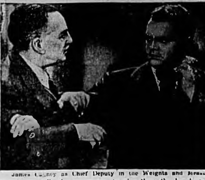
James Cagney as Chief Deputy in the Weights and Measures Department calls the newspapers to give them the low-down on the food racketeers, whose chief is Henry Kolker, on the left.