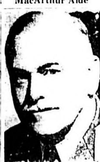
Gen. Sir Thomas Blamey, commander in chief of the Southwest Pacific Command of the United Nations, with headquarters in Australia, announced the selection of Gen. Sir Thomas Blamey as commander of the Australian Army in the Southwest Pacific.