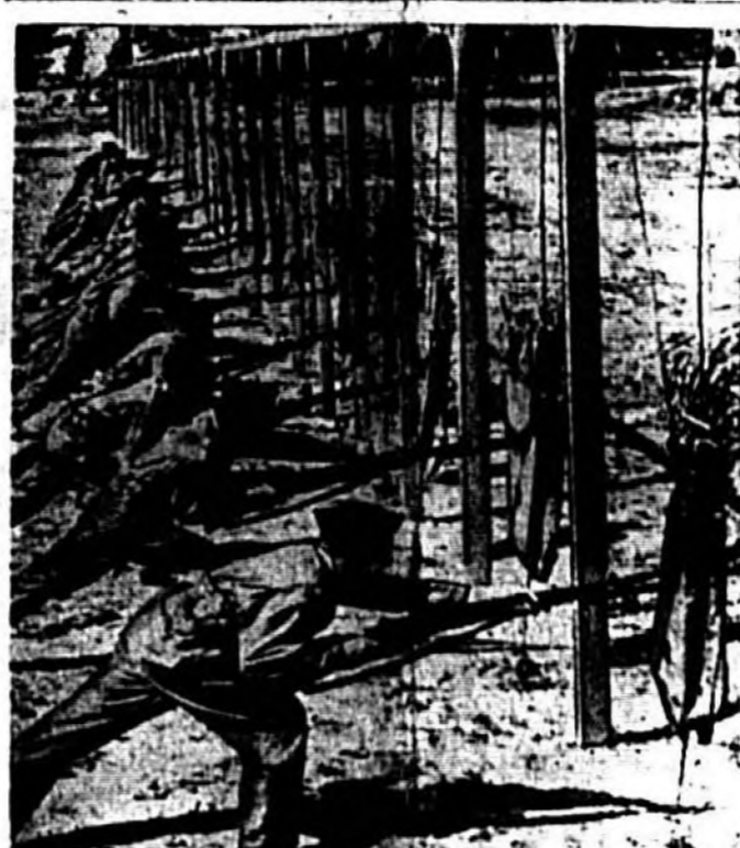
Members of the officers candidate school at Fort Benning are shown at day practice, and they couldn't be more enthusiastic if every dummy were an Axis soldier. The school is now graduating a thousand new officers each week.