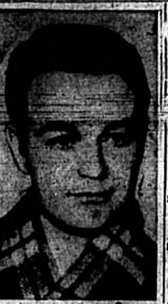
Law Ayres, 53, film star and ex-husband of Ginger Rogers will be seen happily in the picture camp at Casaca Lake, Ore. It was announced by the Los Angeles Selective Service Board...