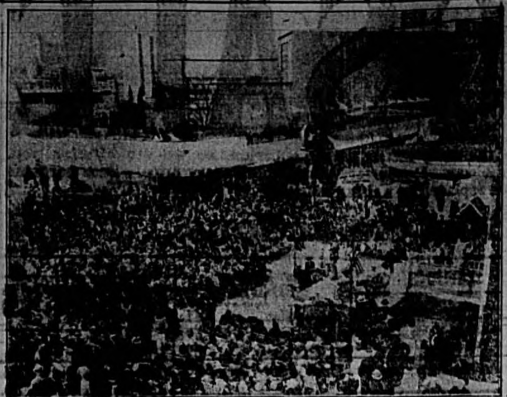
Scene at the dedication of Enchanted Island, the children's fairground at Chicago's World's Fair. The island, which consists of 2 1/2 acres, was opened two weeks in advance of the official opening. Here the parents may check their children with capable attendants while they visit other sections of A Century of Progress and visit the hundreds of interesting exhibits.