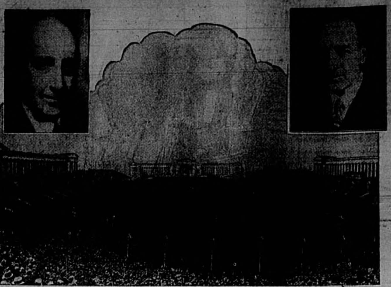
Chicago opened her second World's Fair last Saturday morning promptly at 10 o'clock. Above is shown the interior of Soldier Field stadium where the colorful opening ceremonies took place.