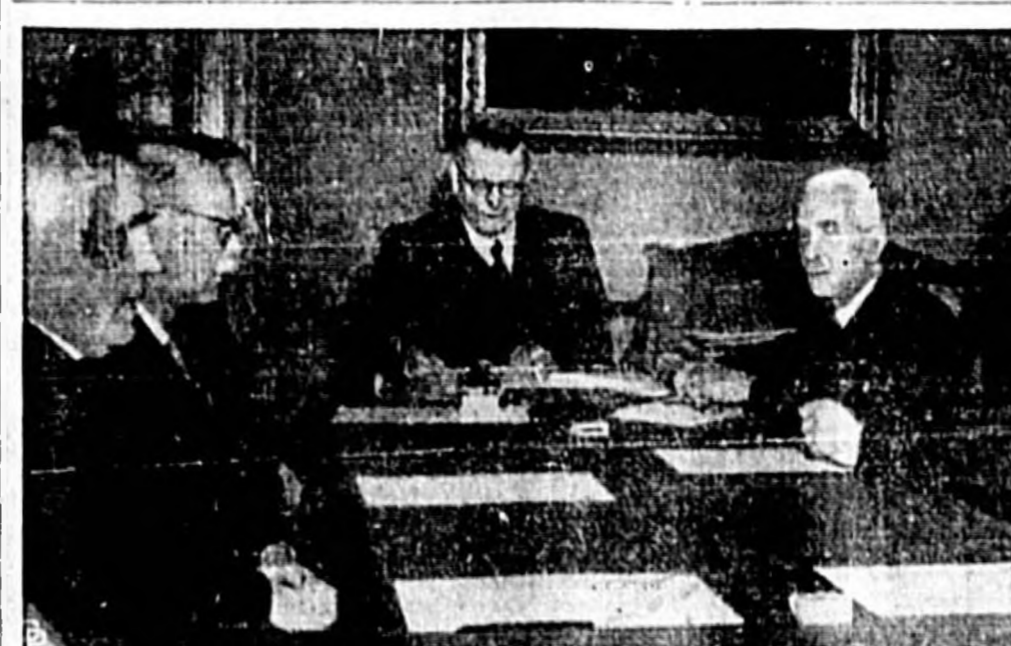
APPOINTED TO CONDUCT THE DISCUSSIONS on the "mutual assistance pact" demanded by Soviet Russia, these Finnish leaders are shown as they met in Helsinki with President Juhani Paasikivi, presumably for a briefing session. Left to right around the table are: M. Dillon, member of the Finnish Parliament, Dr. Kekkonen; M. Pekkala, President Paasikivi; Foreign Minister Enckell and Minister Sovento