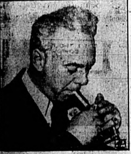
A headline habitue of long standing, Asbestos Herd Tommy Manville jumped into the advertising sections for a change when he took full page ads in New York's morning papers "Wanted: An Attorney, presumably to untangle his snarled marital troubles."