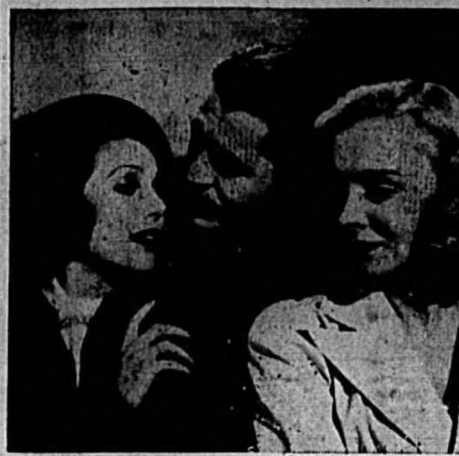
Louise Fazenda and Slim Summerville in Universal's "The Road Back."