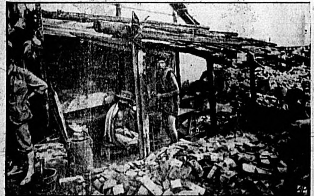
CIVILIZATION STEPS BACKWARD as war strides ahead. This was the scene of utter desolation left by a series of Japanese bombing raids on the Nantao "slums" of Shanghai. Half clothed, forlorn, appearing like prehistoric cave men, these Chinese have built themselves a crude shelter amid the ruins. Charred timbers show evidence of the fire which followed the aerial attacks.