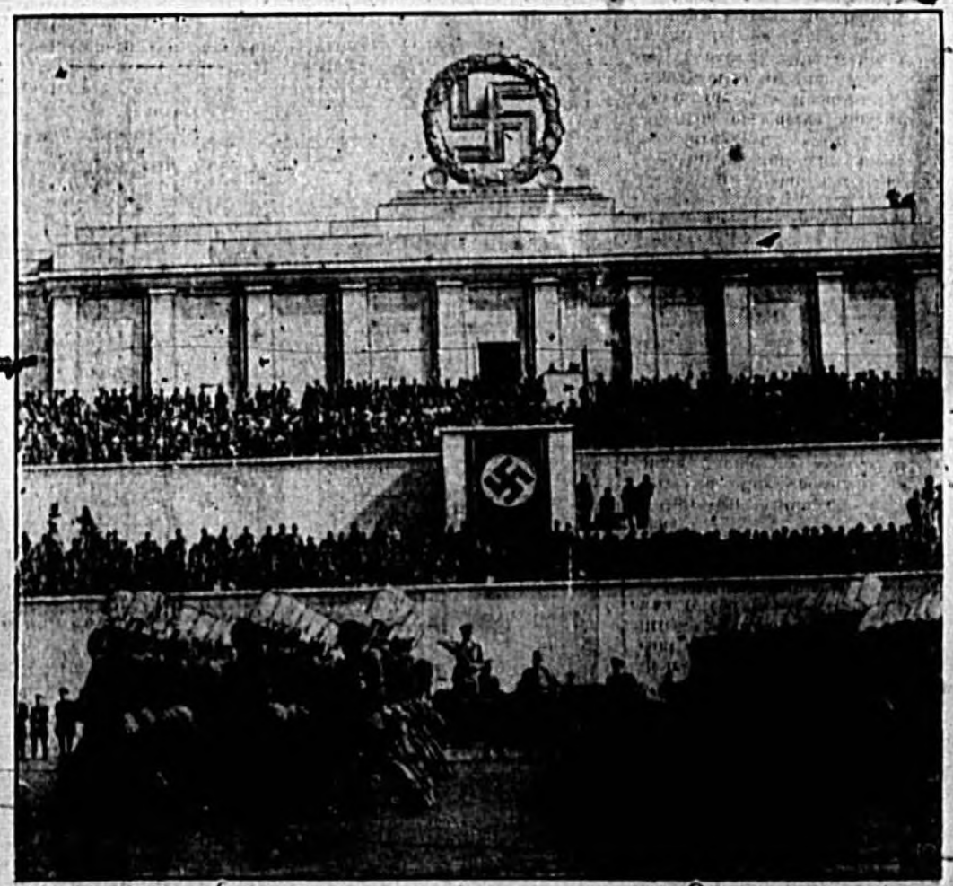
THE AGE OF SPADESMEN , Germany's labor service workers, 22,000 strong, escorted recently past Fuehrer Adolf Hitler at the Nazi party convention in Nuremberg. For two hours the Nazis paraded past their chief and stands crowded with high officials of the Reich. Following the convention Germany opened war games in the greatest martial display since the Armistice.