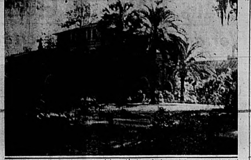
DELAND, Sept. 25.—The house pictured here has been the home of Stetson University's three presidents during the past 50 years.