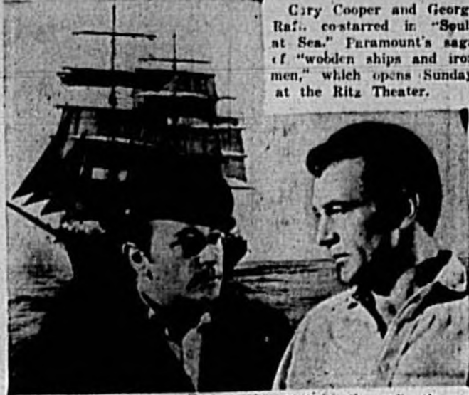
Gary Cooper and George Raft, costarred in "Souls at Sea," Paramount's saga of "wooden ships and iron men," which opens Sunday at the Ritz Theater.

Exactly duplicating the original "William Brown," the ship which was the scene for the strangest drama of the sea ever to be conceived by mortal man, the ship which was used for scenes in "Souls at Sea," brings back the days of a hundred years ago.