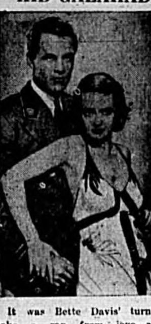
It was Bette Davis' turn to take a rap from love—after a screen devotion in a dozen pictures—and how she takes it in the form of Wayne Morris, 6 feet three inches of fighting manhood, in "Kid Galahad."