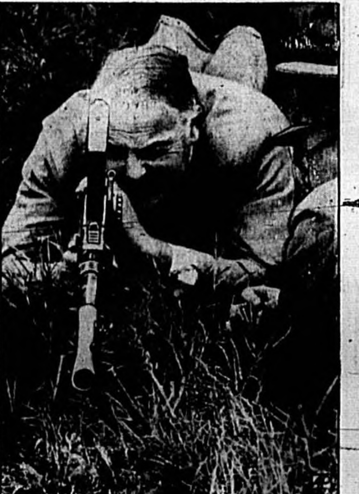
IT'S JUST A GAME , but one of deadly seriousness, that is played by Great Britain's army in its annual war maneuvers. Here is War Minister Horne-Bellah trying his hand at the new Sienn machine-gun on a visit to mimic battles held in Essex, England. These war games give English Tommies the experience necessary for top British Army.