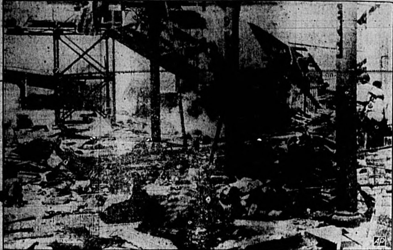
As the smoke of battle cleared away from North Station in Shanghai, rescue squads began the task of removing the dead and wounded. At right in this picture a boy is shown helping a wounded civilian from the scene, while at left a badly wounded child waits for attention.