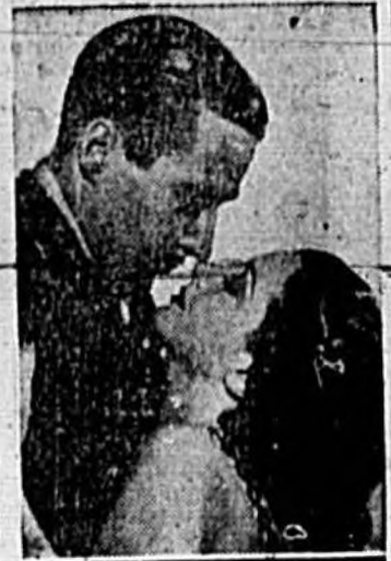
A legal love affair, so to speak, develops between Douglas Montgomery and Jacqueline Wells, his lovely office helpmate, in Columbia's "Council for Crime," at the Ritz Theater Saturday. Montgomery is seen as a fighting prosecutor.

The earliest known express service was organized in 1826 to operate over the Boston-Taunton railway.