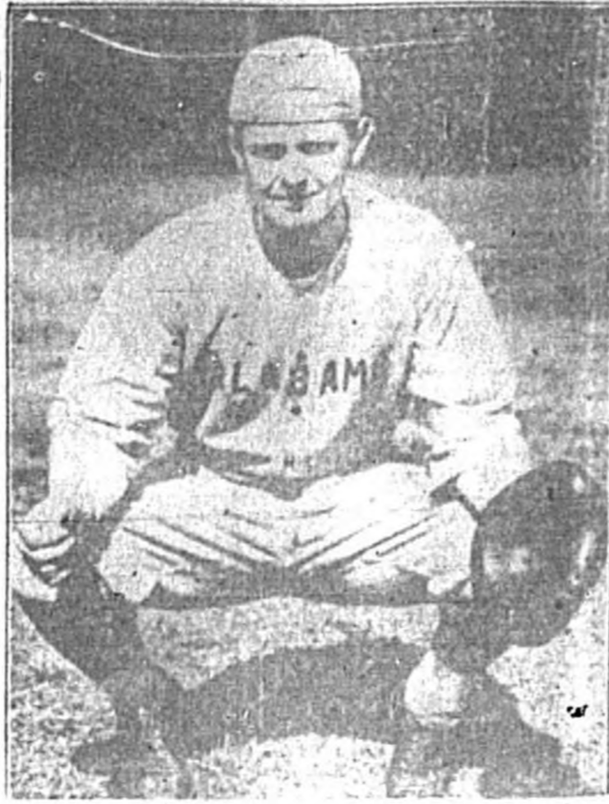
A signing with the pirates...