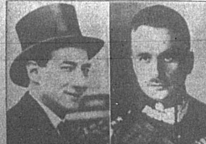
Foreign minister Joseph Beck (left) and General Kazimierz Sosnkowski (right) were prominently mentioned in the list of men regarded as in line to succeed Marshal Joseph Pilsudski, dictator of Poland, whose unexpected death, caused grave concern for the peace of Europe.