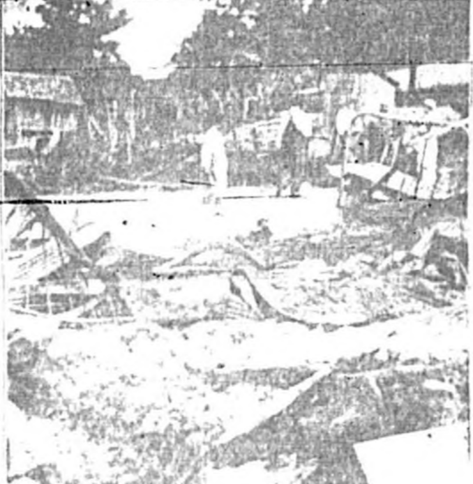
Where four died in Alabama fire...