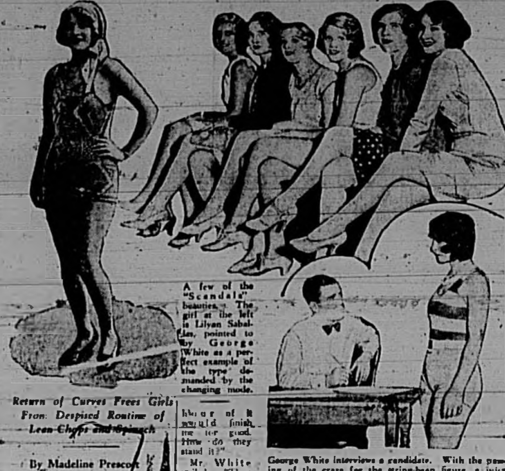
Return of Curves Frees Girls From Dejected Posture of Lean-Chests and Slumped Shoulders

"O'NEIL" again, girls. Snap it up, and don't forget the turn at the end. All right, now, found it out! One, two, three, four, five, six, seven, eight, nine, ten. The director presiding and presiding over the chorus, George White weighed the practical and imperfections of the chorus of his latest "Scandals".