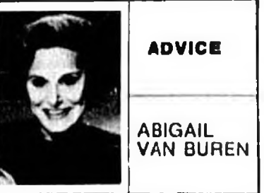
ADVICE ABIGAIL VAN BUREN

DEAR ABBY: My sister, who has always loved to read, recently came for a visit. We now live many miles apart and hadn't seen each other in quite some time. She stayed with another family member, but we made arrangements to spend the day together. When she came over, she had her book in hand and spent most of the time reading. When I tried to converse with her, she'd look up from her book, respond with only a few words, and then she'd go back to her reading. I was hurt and angered by her rudeness but didn't say anything because I didn't want to make waves for the short time she was here. She has always