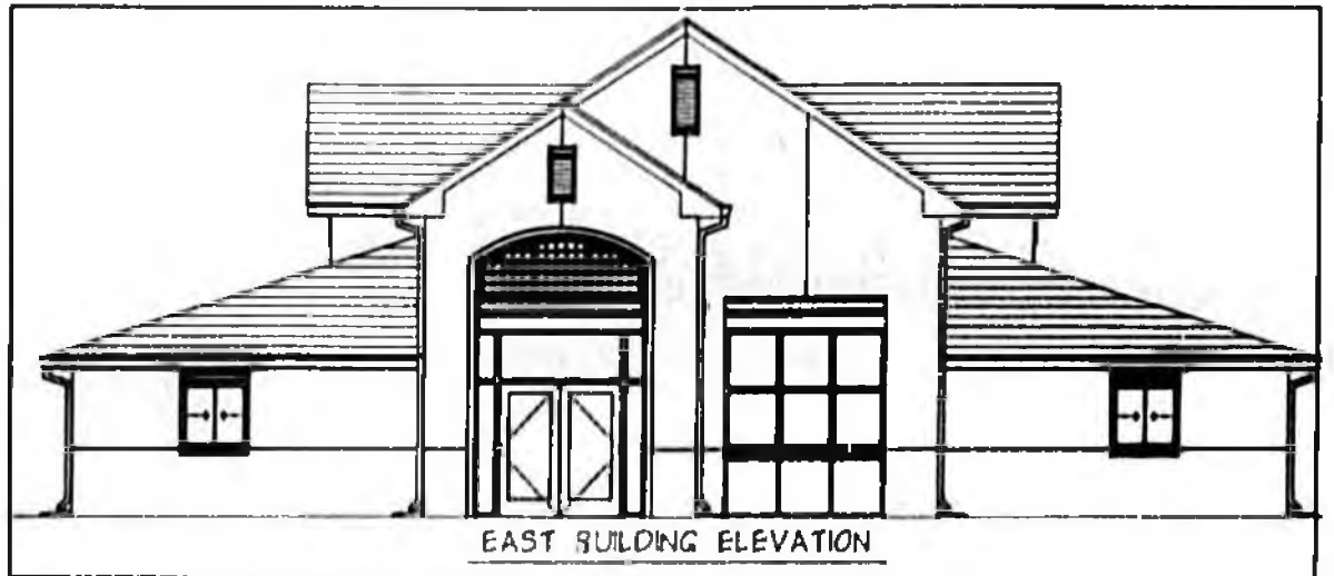
EAST BUILDING ELEVATION

Farmer&Baker Architects, Inc. have proposed this design for the homeless shelter.