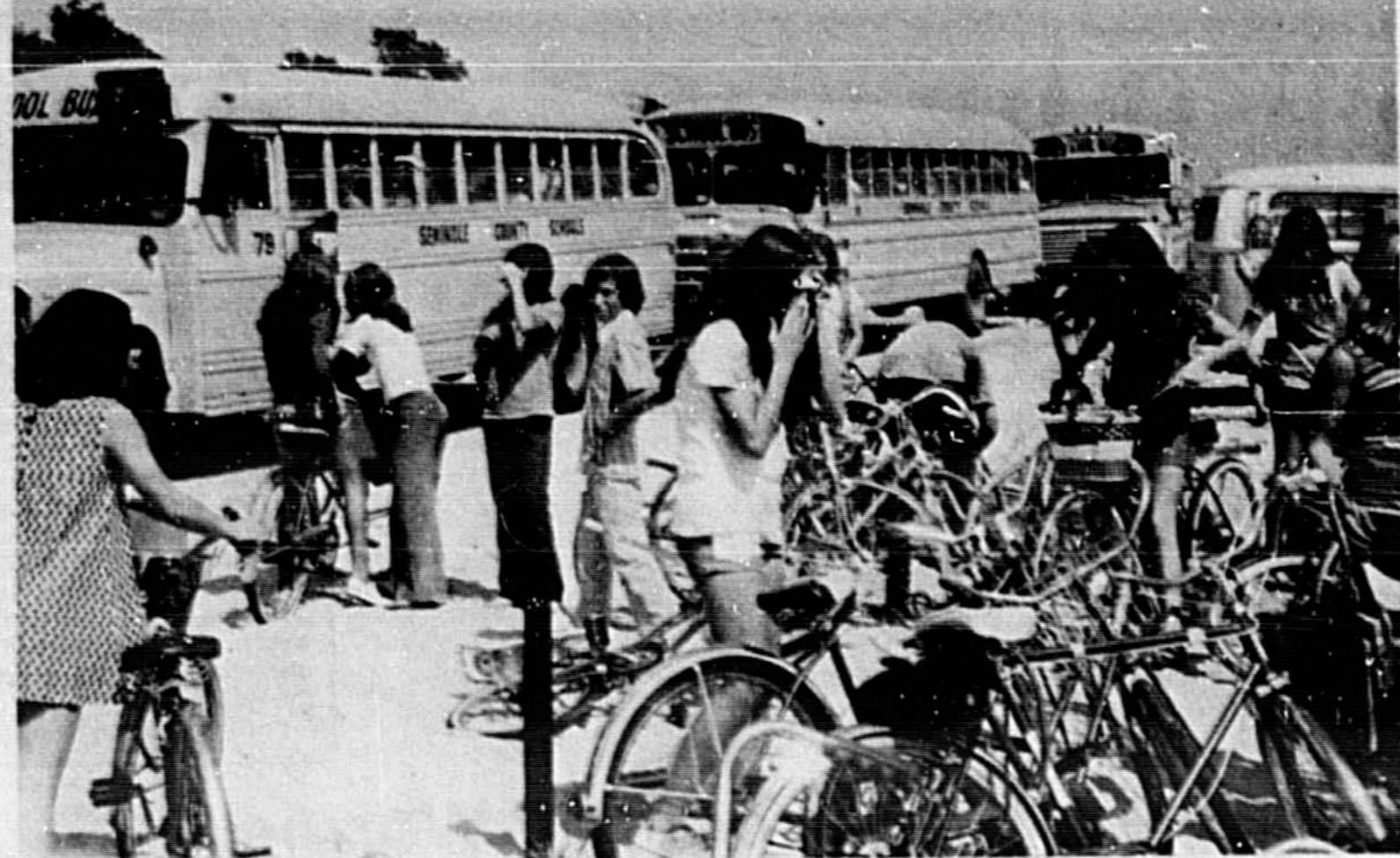
PARENTS OF students attending South Seminole Middle School and Casselberry Elementary are up in arms over the route buses take when leaving the schools. Crystal Bowl Circle, an unpaved road, has been closed to bus traffic, forcing the buses to come back through the busy parking lot, also unpaved. The Herald