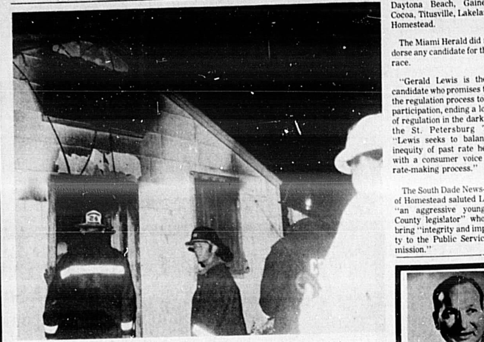
CASSELBERRY Volunteer Fireman practice fire-fighting techniques by setting fire to converted WWII army barracks on Seminola Boulevard at owners request. Several unsightly buildings in the city were recently condemned under the new condemnation ordinance.