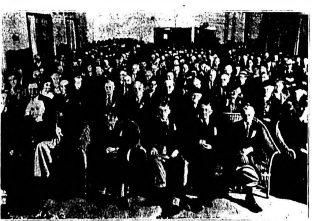
Pictured above are 92 early residents of Seminole County who attended the eightieth annual pioneer celebration in New Year's Eve.