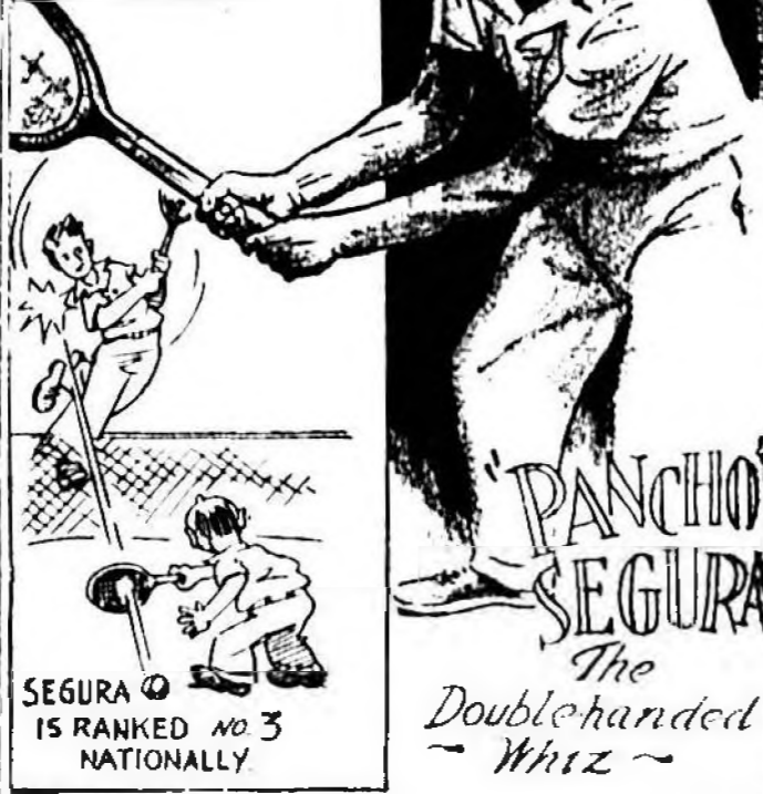
'PANCHO' SEGURA The Doublehanded Whizz SEGURA IS RANKED NO. 3 NATIONALLY

ECUADOR'S GIFT TO THE AMERICAN TENNIS COURTS HE ALREADY HAS WON ONE IMPORTANT TOURNEY THIS YEAR—THE SUGAR BOWL CROWN