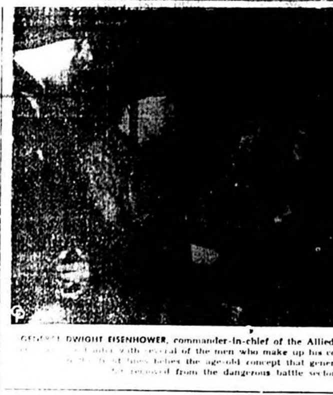
General Dwight Eisenhower, commander-in-chief of the Allied forces in North Africa, stops to see...