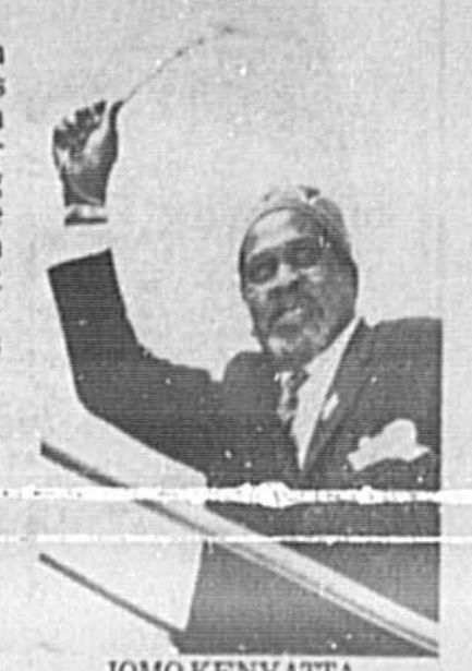
JOMO KENYATTA ... He's proud

lack of natural resources did not prevent Japan from performing its economic miracle. Theoretically Kenya might be able to follow in Japan's steps by concentrating on industrial exports but the government is either unsure of the right policy to achieve this ambition or is unprepared for political reasons, to pursue it. The government has been lucky so far that each year its serious failures have been more than compensated for by exceptionally strong growth in other sectors of the economy. Kenya has much going for it: an external debt burden that remains reasonable, a creditworthiness that has allowed it to borrow in the Eurodollar market, a flexibility in import controls that successfully plugged a hole in its foreign exchange reserves late in 1971, and the luck of a soaring world commodity prices which has helped to build up those reserves by as much as 45 per cent (in dollar terms) in the past year.